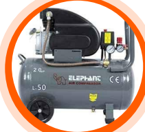
ELEPHANT MAKE 2 HP AIR COMPRESSOR