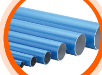
ALUMINUM AIR PIPING