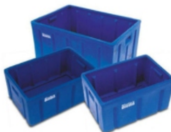
Industrial Plastic Crate