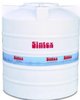
Triple Layer White Water Storage Tank