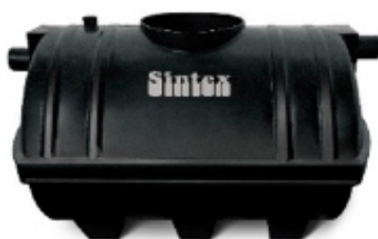
Plastic Septic Tank