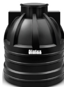
Sintex Septic Tanks