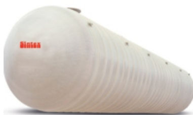
FRP Chemical Storage Tanks