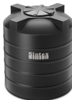
Rain Water Tanks