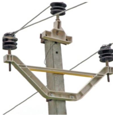
FRP V Type Arms (Rec Design)