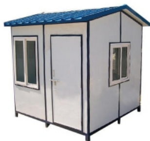
Prefabricated Anganwadi Building