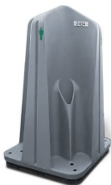
FRP Modular 4 Person Portable Urinal