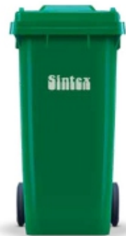
Sintex Wheeled Plastic Waste Bins