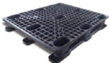
Injection Moulded Industrial Pallet