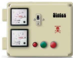
Starter Panels For Agriculture