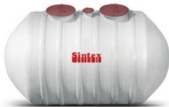
Underground Water Tank