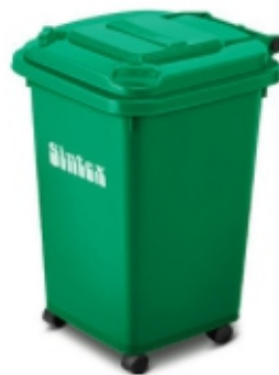
Euroline Range Wheeled Dustbin