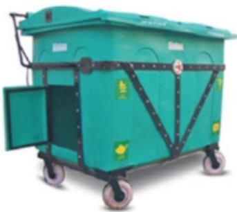
Giant Wheeled Waste Bin