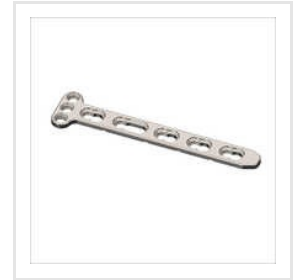
2.7 Mm T Dorsal Plate