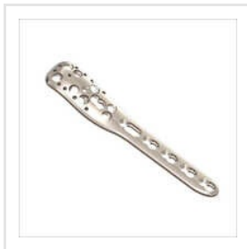
3.5Mm Proximal Humerus Plate