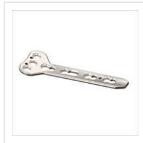
3.5Mm T Right Angled Plate