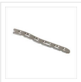
2.7 Mm Straight Dorsal Plate