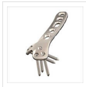
Posterolateral Distal Humerus Plate