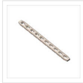
2.7 Mm Dynamic Compression Plate