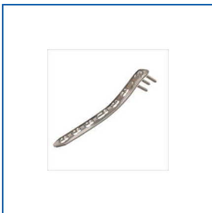
DISTAL MEADIAL HUMERUS PLATE

2.7 Mm Dynamic Compression Plate, 2.7 Mm Straight Dorsal Plate, 2.7 Mm T Dorsal Plate, 3.5 Mm Limited Contact Dynamic Compression Plate, 3.5 Mm Reconstruction Plate, 3.5 Mm T Oblique Angled Plate, 3.5Mm Dorsal Plate, 3.5Mm Proximal Humerus Plate, 3.5Mm T Right Angled Plate, 4.5 Mm Reconsturction Hole Plate, Distal Meadial Humerus Plate, Distal Ulna Plate, Extra Articular Distal Humerus Plate, Kirschner Wire, Olecranon Plate, etc.