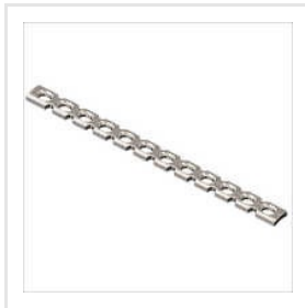
4.5 Mm Reconstruction Hole Plate