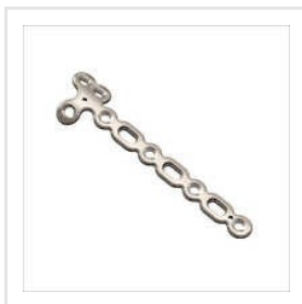
Distal Ulna Plate