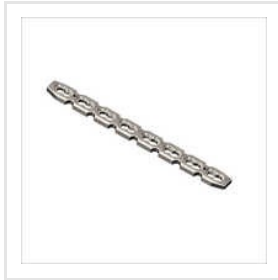
3.5 Mm Reconstruction Plate