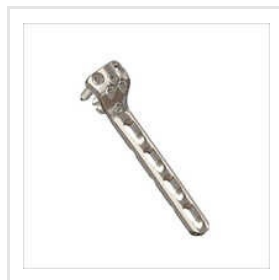
Radial Head Rim Plate