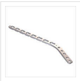
Extra Articular Distal Humerus Plate