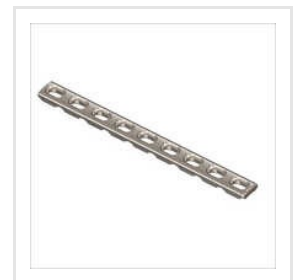
3.5 Mm Limited Contact Dynamic