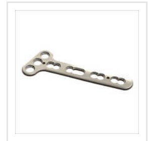
3.5 Mm T Oblique Angled Plate