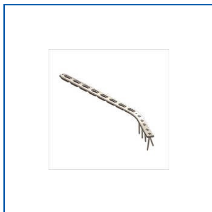
EXTRA ARTICULAR DISTAL HUMERUS PLATE