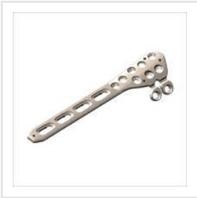
Proximal Humerus Periarticular Posterior