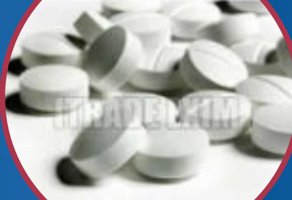
Azit 500mg Tablets