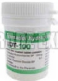
100mg Tramadol Hydrochloride Tablets