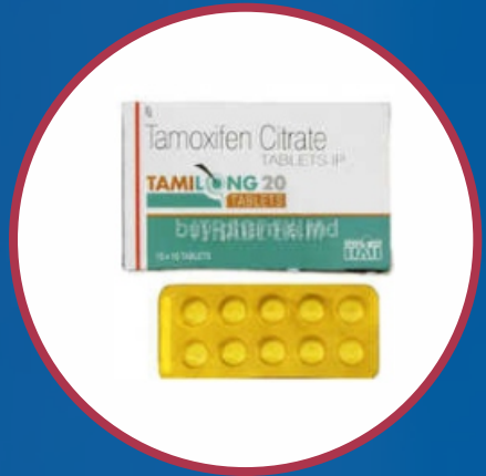
20mg Tamoxifen Citrate Tablets IP