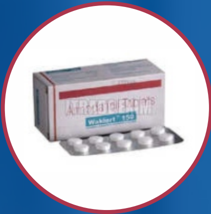
150mg Armodafinil Tablets