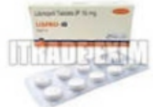
10 mg Lisinopril Tablets IP