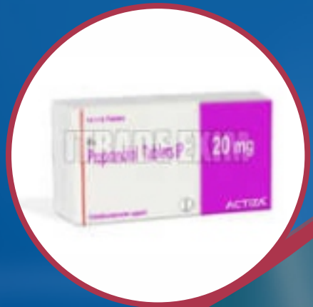
20mg Propranolol Tablets IP