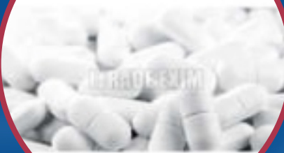
Duratia 60mg Tablets