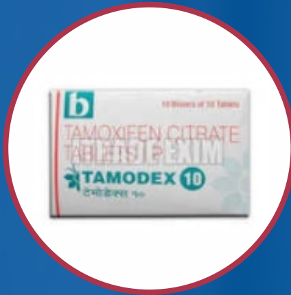
10mg Tamoxifen Citrate Tablets IP