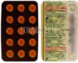
20mg Prednisolone Dispersible Tablets