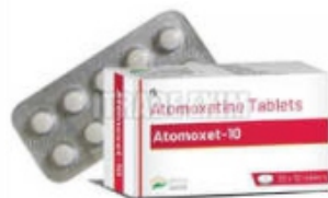
10mg Atomoxetine Tablets