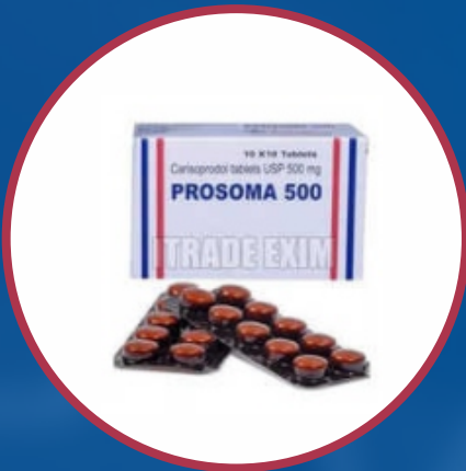
500mg Caarisoprodol Tablets USP