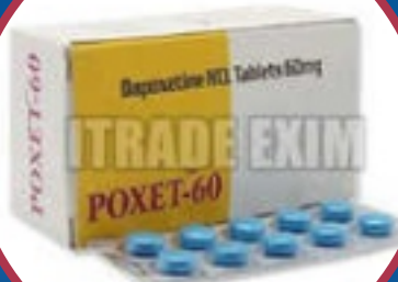
60mg Daapoxetine HCL Tablets