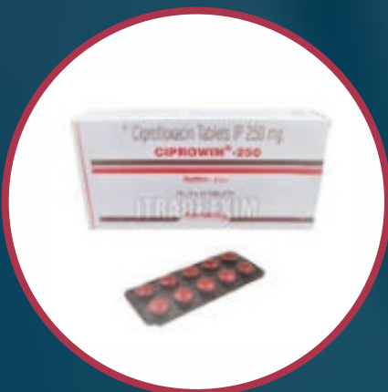
250mg Ciprofloxacin Tablets IP