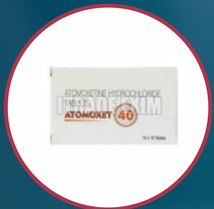
40mg Atomoxetine Hydrochloride Tablets