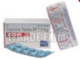
7.5mg Zopiclone Tablets BP