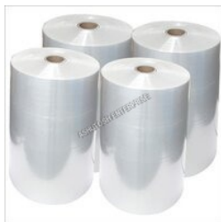
WIDE WIDTH PACKAGING FILM

Agriculture and Gardening Net, Building And Civil Construction Net, Consumer And Packaging Net, Flat Square Mesh Net, Flexible Packaging Film, Industrial Netting Solutions Net, LDPE Shrink Films, Laminated Poaching Roll And Pouch, MAP Packaging Films, PE Packaging Film, PET Sheets, PP Sheets, Printed Heat Transferred Label, Printed IML Labels, Printed Labels, etc.