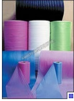
PE Packaging Film