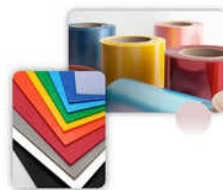
Rigid PVC Sheets