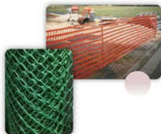
Industrial Netting Solutions Net