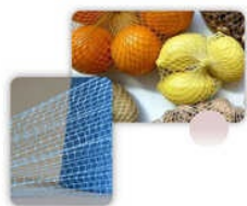
Consumer And Packaging Net