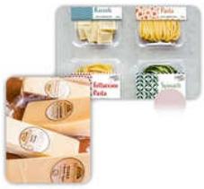
MAP Packaging Films