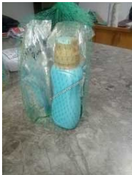
Raschel Mesh Bags