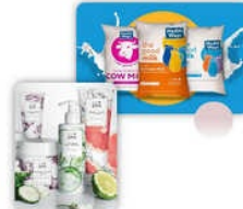
Flexible Packaging Film