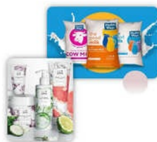
FLEXIBLE PACKAGING FILM