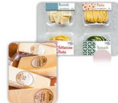
MAP PACKAGING FILMS