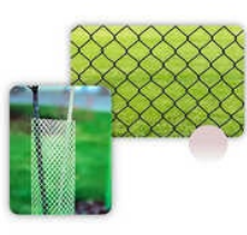
Agriculture And Gardening Net