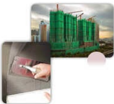
Building And Civil Construction Net