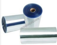
LDPE Shrink Films