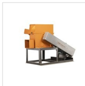
SHREDDER MASTER 10 HP