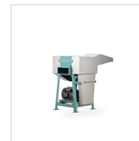
Chaff Cutter Horizonta