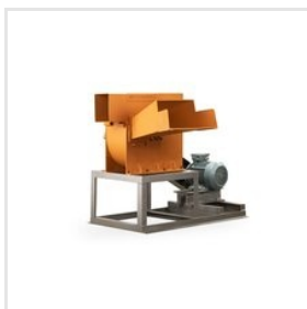
Shredde Master 5 HP