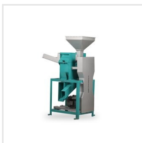
Chaff Cutter Cum Pulvariser Separata