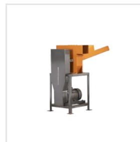
Shredder Rigider 5hp