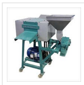
Chaff Cutter Cum Pulvariser Horizonta