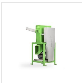
CHAFF CUTTER- ICONICA