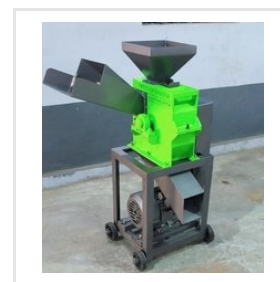
Chaff Cutter Sappakutta