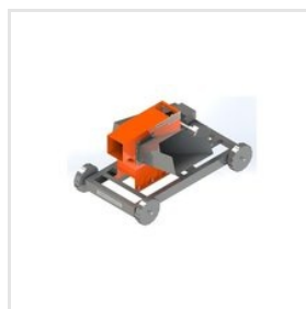
Shredder Beaster 3HP