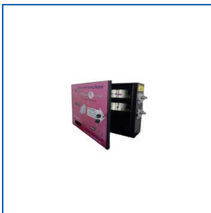
MANUAL SANITARY NAPKIN VENDING MACHINE

Automatic Sanitary Napkin Vending Machine, Bio Medical Waste Incinerator, Diaper Incinerator Machine, Face Mask And Sanitary Napkin Incinerator Machine, Food Waste Organic Composting Machine, Green Blue Garbage Tricycle Rickshaw, HH 50 Sanitary Napkin Incinerator, Industrial Sanitary Napkin Vending Machine, MS Garbage Dustbin, etc.