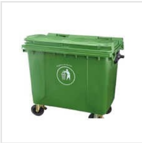
Plastic Waste Container