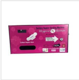
Manual Sanitary Pads Vending Machine