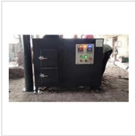
Municipal Solid Waste Incinerator