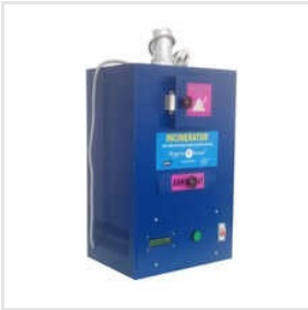
Sanitary Napkin Incinerator Machine