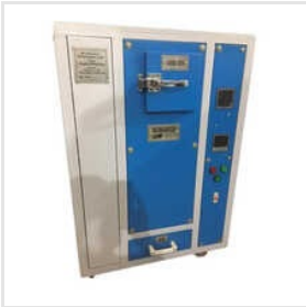
PPE Kit Waste Incinerator