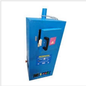
Diaper Incinerator Machine