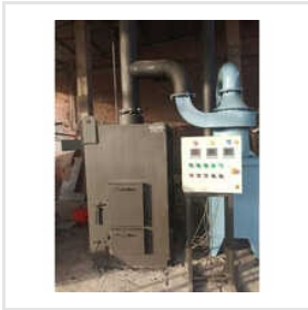
Bio Medical Waste Incinerator