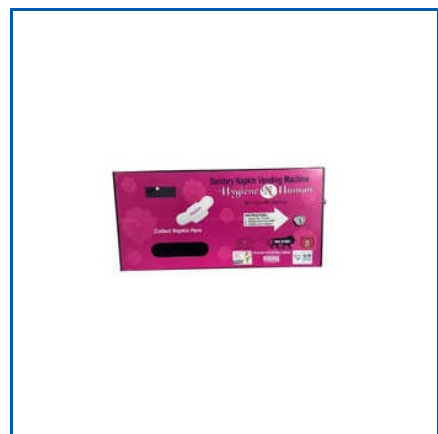
MANUAL SANITARY PADS VENDING MACHINE