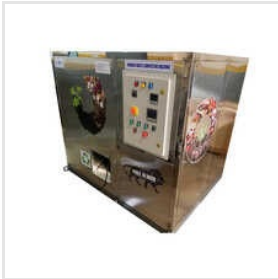
Food Waste Organic Composting Machine