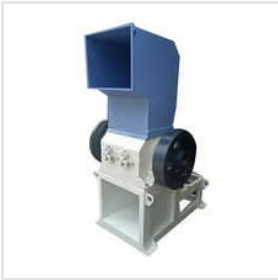
Pet Bottle Shredder Machine