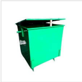
MS Garbage Dustbin