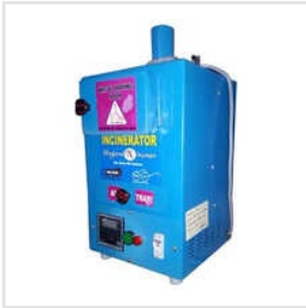
HH 50 Sanitary Napkin Incinerator