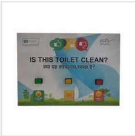
Toilet Feedback Machine