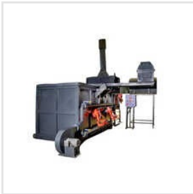
Small Animal Waste Incinerator