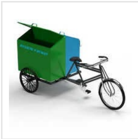
Green Blue Garbage Tricycle Rickshaw