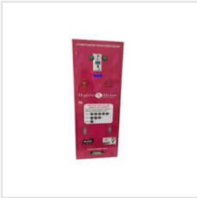
Automatic Sanitary Napkin Vending