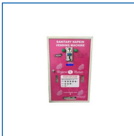
INDUSTRIAL SANITARY NAPKIN VENDING MACHINE