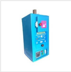
Face Mask And Sanitary Napkin