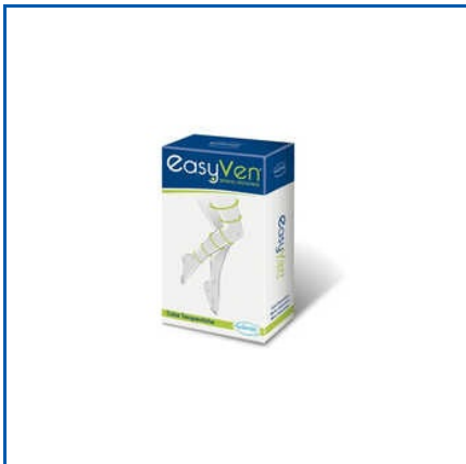
VARICOSE VEIN THIGH LENGTH STOCKING

10cm x 4m Advanced Soft Compression Bandage, 15cm x 4m Hi Grip VC Soft Advanced Compression Bandage, 500 ML Sterillium Hand Sanitizer, Anti Embolism Knee Length Stocking, Comfort Cotton Class 2 Knee Length Stocking, Compression Bandage, Compression Stocking Applicator, Diabetic Socks IDIAB, Diode Medical Laser Machine on rent, etc.