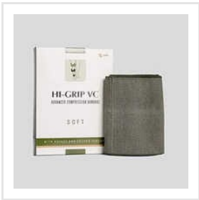
10cm X 4m Advanced Soft Compression