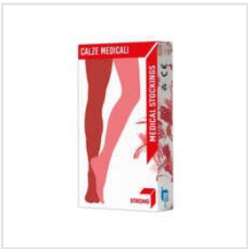
Strong Class 3 Knee High Stockings