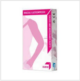
Gloria Lymphedema Class 2 Arm Sleeve