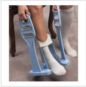
Compression Stocking Applicator