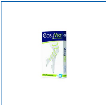
VARICOSE VEIN CLASS 2 KNEE HIGH STOCKING