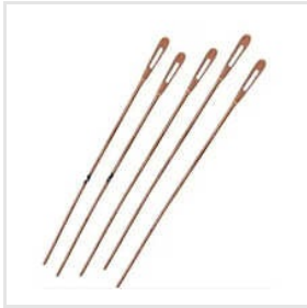
Malleable Fistula Probe