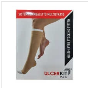
Ulcer Kit Varicose Stocking