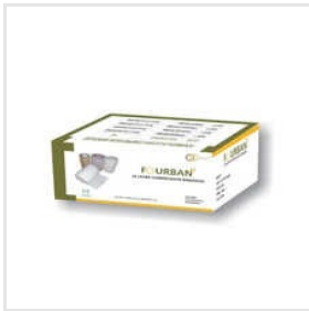
Fourban 4 Layer Compression Bandage