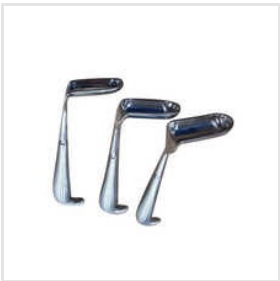
Proctoscope OPE Full Cut