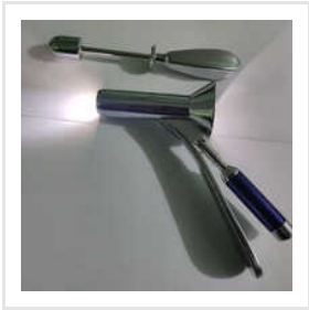
Proctoscope With Led Light