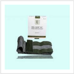
15cm X 4m Hi Grip VC Soft Advanced