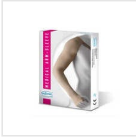
Lymphedema Class 2 Arm Sleeve With Belt