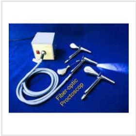
Proctoscope With Light Source