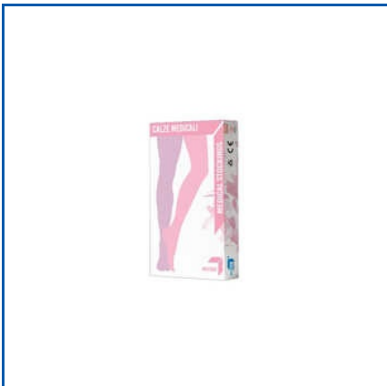
MICROFIBER CLASS 1 KNEE HIGH STOCKINGS