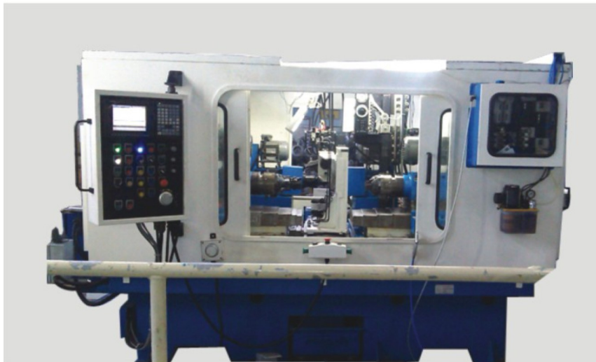
CNC SPM FOR OD TURNING/ BORING & FORK MACHINING

Special purpose machine is a means of achieving lower production cost by increasing productivity. In design of SPMs, we retain features which are essential for the operations, thus reducing the costs. Wherever possible, operations are combined so as to reduce the number of settings and labour involvement. This also improves the component accuracy. SPMs gives you higher output at much lower cost, compared to machining on VMC/HMC. Multispindle drilling/tapping technology will boost productivity, assure quality and reduce cost of operations enable to withstand global competition. We help you to keep pace in the race to globalization. Our specialization is in automatic machines and machining technology. We offer complete machining solutions using appropriate technology.