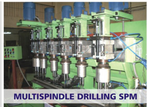
MULTISPINDLE DRILLING SPM