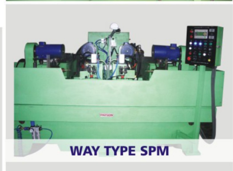
WAY TYPE SPM