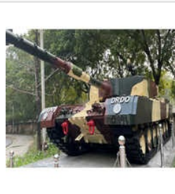
Infrared Camouflage Paint