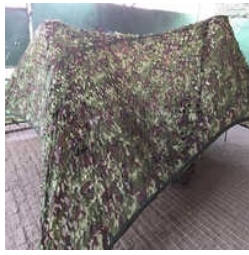
Single Synthetic Camouflage Net