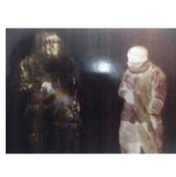
Thermal Shielding Effectiveness Ghillie