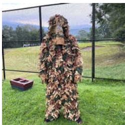
Thermal Ghillie Suit