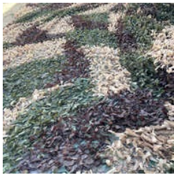
Camouflage Net Shrimp