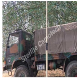
HS Dual Terrain Reversible Synthetic