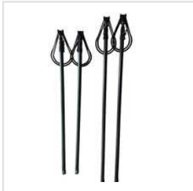
Metal Telescopic Poles