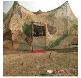
Single Camouflage Net Shrimp