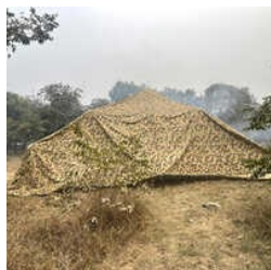
MULTISPECTRAL CAMOUFLAGE NET

Camouflage Net Shrimp, Camouflage Parasols, HS Dual Synthetic Camouflage Net, HS Dual Terrain Reversible Synthetic Camouflage Net, IS 220 Olive Green Camouflage Paint, IS 278 Light Olive Green Camouflage Paint, Infrared Camouflage Paint, MSCN Repair Kit, Metal Telescopic Poles, Military Fabrics, Multispectral Camouflage Net, Reversible Multispectral Camouflage Net, Single Camouflage Net Shrimp, Single Synthetic Camouflage Net, Synthetic Camouflage Nets For Barren Mountains And Snow Bound Areas, etc.