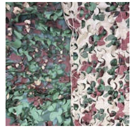
HS Dual Synthetic Camouflage Net