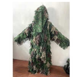
Visual Ghillie Suits