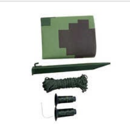
MSCN Repair Kit