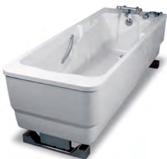
TR COMFORTLINE II Available in fixed height version