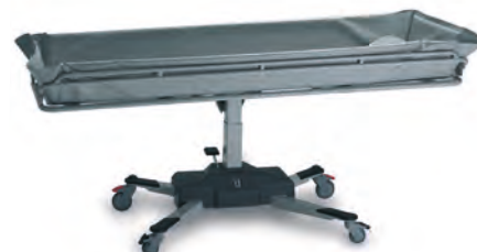
TR 2000 Available with various stretcher lengths