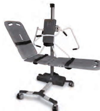
TR 9650 Stretcher/Combilift