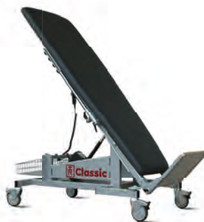
TR Classic Tilt table

TR Equipment offers a tilt table used for rehabilitation purposes