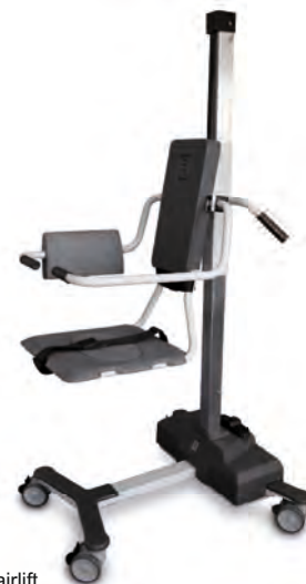
TR 9650 Chairlift