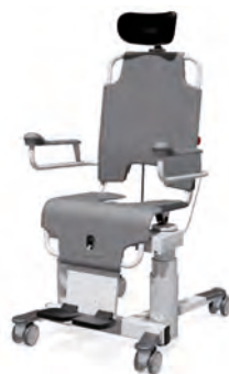
TR 1000 Battery operated height adjustment and tilt