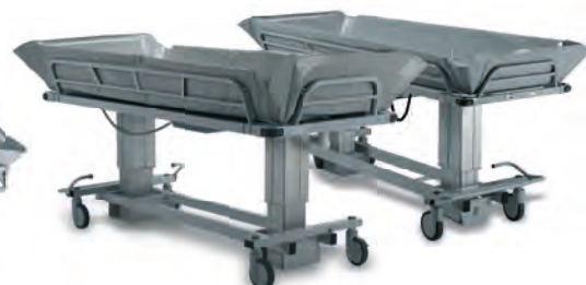
TR 4000 ATLAS Working Load Limit: 450 kg/1000 lbs