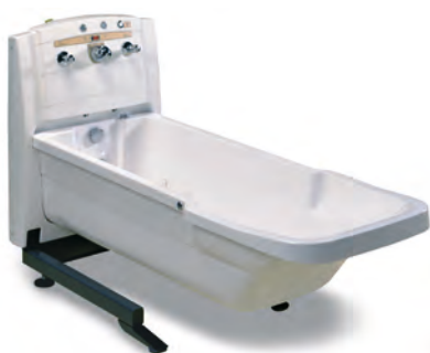
TR 900 Available with stainless steel tub