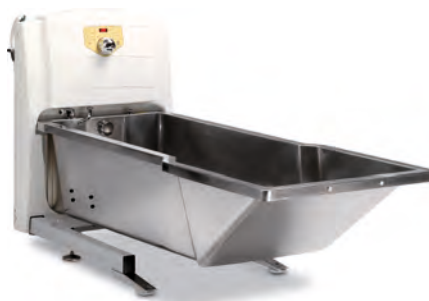
TR 900A Available with fibre glass tub