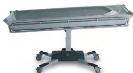
TR 3000 Available with various stretcher lengths