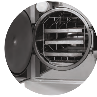
TABLE TOP - STEAM STERILIZER

A wide range of washer/disinfectors for use in hospitals (and CSSD) to disinfect surgical instruments, anaesthesia and respiratory products, hospital utensils, glassware, containers, operating shoes, and other devices that require high-level disinfection.