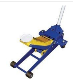
Double Plunger Jack