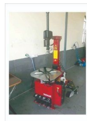
AUTOMATIC TYRE CHANGER