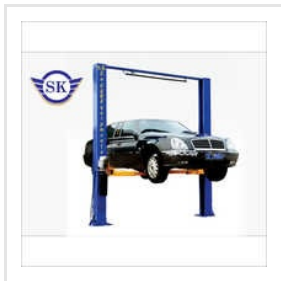
Two Post Lift