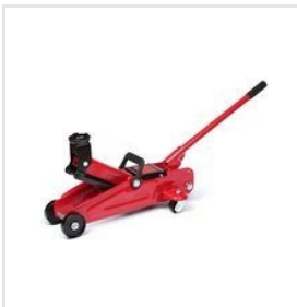
Double Plunger Jack