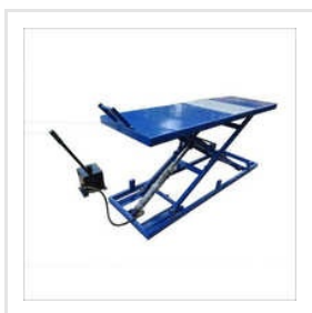
Two Wheeler Manual Ramp