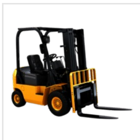
Forklift Repair And Services