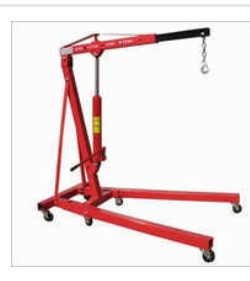
Hydraulic Floor Crane