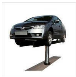
HYDRAULIC CAR WASHING LIFT