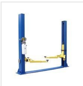
Two Post Lift