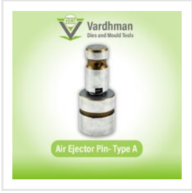
Air Ejector Pins