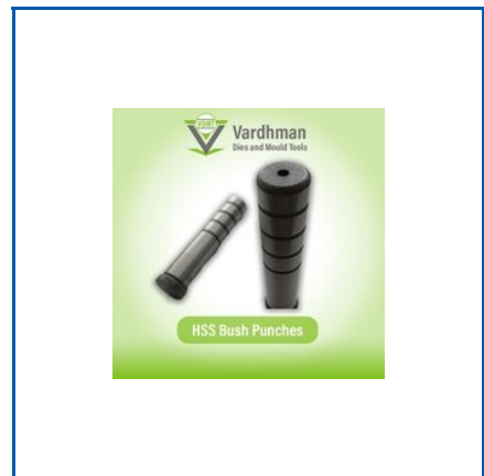
HSS BUSH PUNCHES