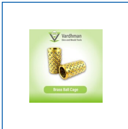
BALL BRASS CAGE