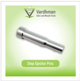
Stepped Ejector Pins