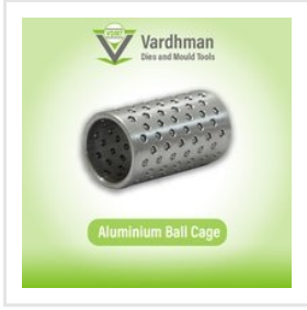
Aluminium Ball Cage