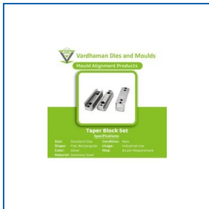
TAPER BLOCK SET

Air Couplings, Air Ejector Pin Type A, Air Ejector Pin Type B, Air Ejector Pins, Aluminium Ball Cage, Aluminum Cylindrical Ball Cage, Ball Brass Cage, Ball Cages, Bellow Couplings, Black Head Annealed Punch, Blade Ejector, Blade Ejector Pins, Brass Ball Cage, Brass Couplings, Bush Couplings, etc.