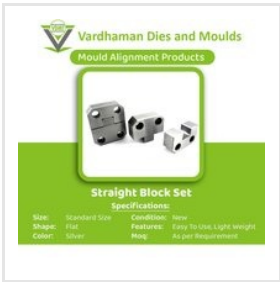
Straight Block Set