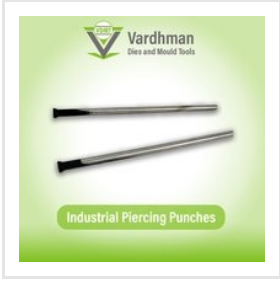
Industrial Piercing Punches