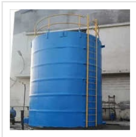
FRP Acid Storage Tank