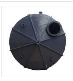
PP FRP HCL Tank