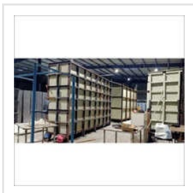
RECTANGULAR PP Storage Tank