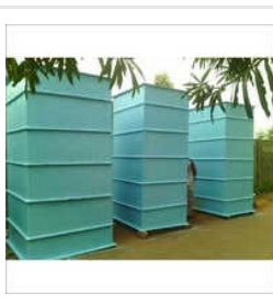
FRP Rectangular Tank