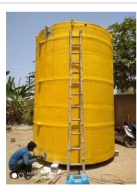
PP FRP CHEMICAL Tank