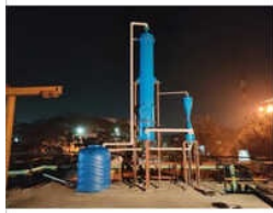
PP FRP Scrubber