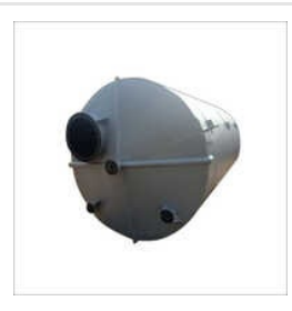
FRP Chemical Tank