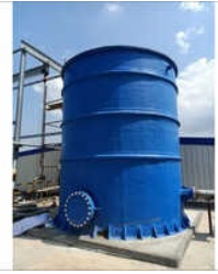
FRP Chemical Storage Tank .