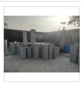
Industrial FRP Ducts