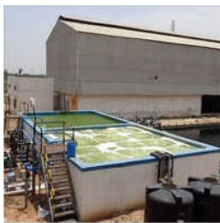
ACID PROOF FRP COATING SERVICES

Acid Proof FRP Coating Services, Civil Tank FRP Coating Services, FRP Acid Storage Tank, FRP Chemical Storage Tank ., FRP Cone Bottom Storage Tanks, FRP Rectangular Tank, FRP Tank, FRP Underground Horizontal Water Tank, FRP Underground Water Tank, FRP chemical Tank, Industrial Chemical Storage Tank, Industrial FRP Ducts, Industrial FRP Lining Work, Industrial chemical storageTank, PP FRP CHEMICAL Tank, etc.