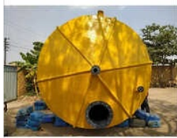
PP FRP Chemical Storage Tanks