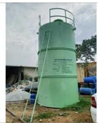
Sulfuric Acid Storage Tank