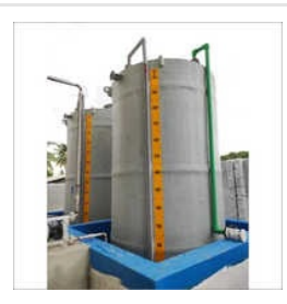
Industrial Chemical Storage Tank