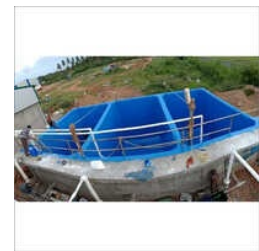
INDUSTRIAL FRP LINING WORK