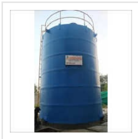
Industrial Chemical Storage Tank