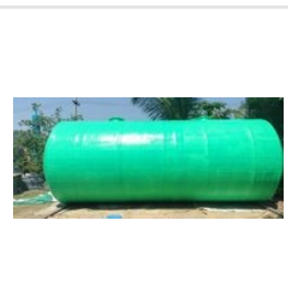
FRP Underground Horizontal Water Tank