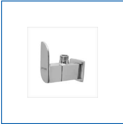
CP ANGLE COCK WITH FLANGE