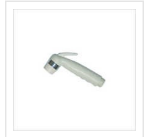
Faucet With PVC Tube And Hook