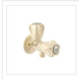
15mm 2 In 1 Angle Cock With Flange