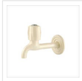
15mm Long Body Bib Cock With Flange