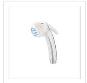
Italian 2 In 1 Faucet