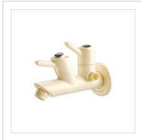
2 Way Bib Cock With Flange