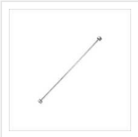
450 Mm Copper Connection Pipe With