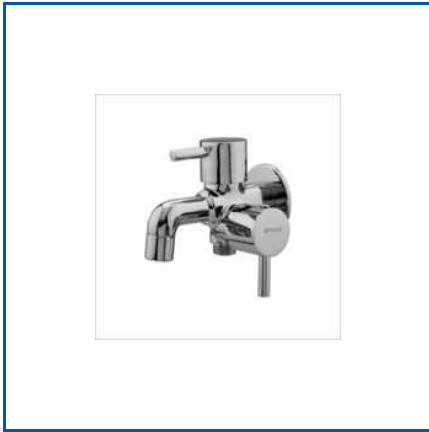
2 WAY DOUBLE HANDLE BIB COCK WITH FLANGE

Marvel, MFI & UTM, Nylon Red, PET Amber, Spectrophotometer Test, Tripolene Blue, Twin Screw Extruder, etc.