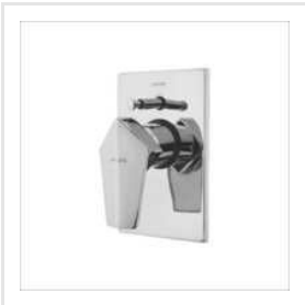
High Flow Single Lever Concealed Diverter