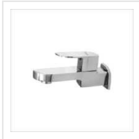
Bib Cock Long Nose With Wall Flange