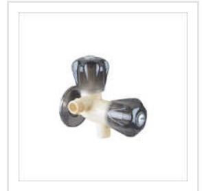
15mm 2 Way Angle Cock With Flange