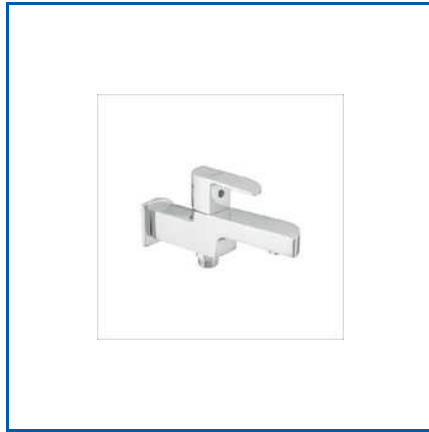
2 WAY SINGLE HANDLE BIB COCK WITH FLANGE