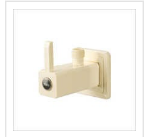
Angle Cock With Flange