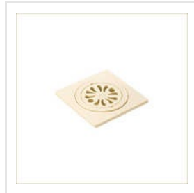
PVC Cockroach Trap