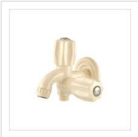
15mm Foam Flow 2 Way Bib Cock