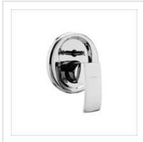
High Flow Single Lever Concealed Diverter For