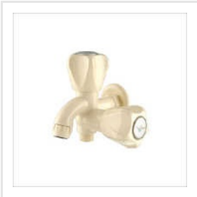
15mm (RH) WF 2 Way Bib Cock