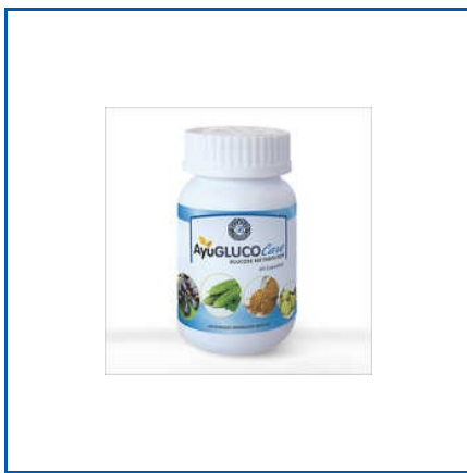
DIABETIC CARE CAPSULES

Ayurvedic Pain Relief Capsules, Ayurvedic Pain Relief Spray, Diabetic Care Capsules, Joint Pain Relief Powder, Shree Bajrang Lep, etc.