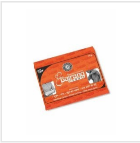
Shree Bajrang Lep