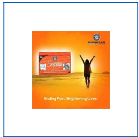
JOINT PAIN RELIEF POWDER