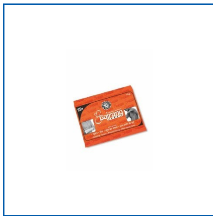
SHREE BAJRANG LEP