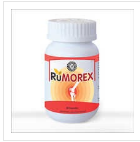
Ayurvedic Pain Relief Capsules