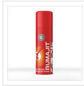
Ayurvedic Pain Relief Spray