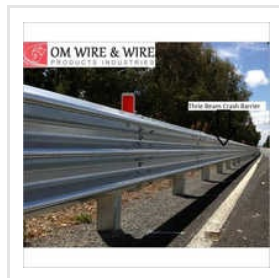
W Beam Highway Crash Barriers