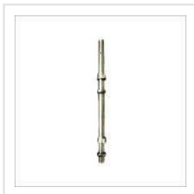
Cuplock Components Verticals Standard