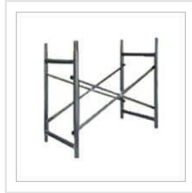
H Frame Scaffolding