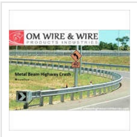
Beam Crash Barrier