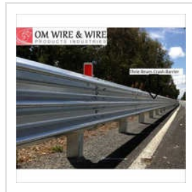
Thrie Beam Highway Crash Barrier