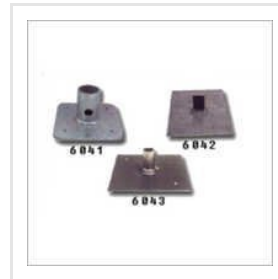
Base Head Plates