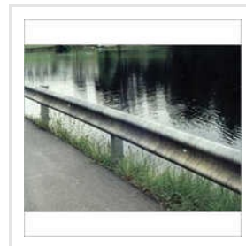
Metal Beam Crash Barriers