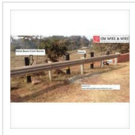
Metal Beam Crash Barrier