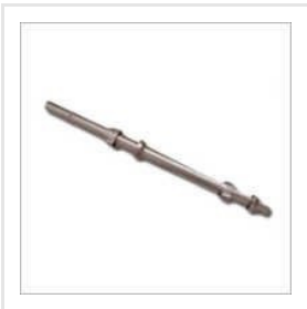
Vertical Standard Cuplock