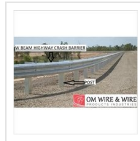
W Beam Highway Crash Barrier