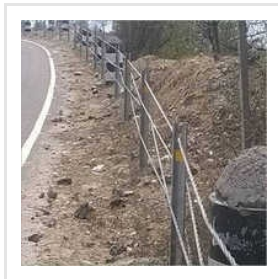
Wire Ropes Safety Barriers