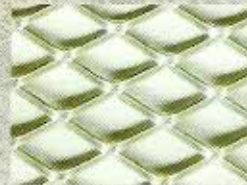
EXPANDED METAL SHEETS