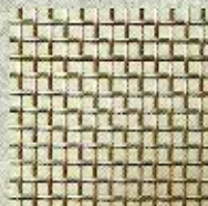
WOVEN WIRE MESH