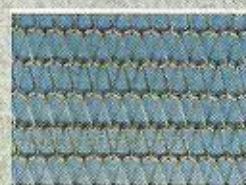
WIRE / RUBBER CONVEYOR BELTS