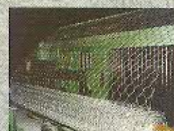
HEXAGONAL WIRE NETTING