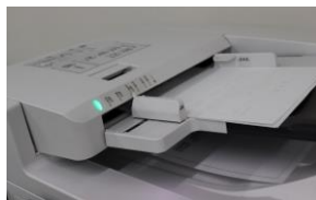
Asset Label Signage