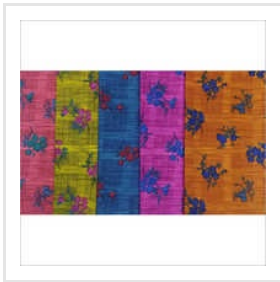
Ladies Nighty Gown Fabric