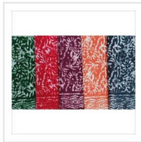
Ladies Printed Cotton Nighty Fabric