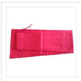
Plain Patti Interlock Petticoat