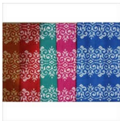
PRINTED COTTON NIGHTY FABRIC ELEGANT PRINTED NIGHTY FABRICS

1 Inch Plain Patti Petticoat, Colour Dyed Poplin Fabric, Cotton Nighty Fabrics, Cotton Petticoat, Dyed Cotton Poplin Fabric, Dyed Poplin Fabric, Elegant Printed Nighty Fabrics, Fine Poplin Fabric, Harmony Dyed Poplin Fabric, Jumbo Cotton Petticoat, Ladies Cotton Nighty Fabric, Ladies Cotton Nighty Fabrics, Ladies Fancy Nighty Fabric, Ladies Floral Printed Nighty Fabric, Ladies Nighty Fabric, etc.