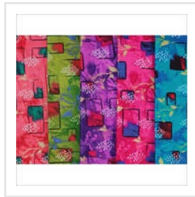
Ladies Fancy Nighty Fabric