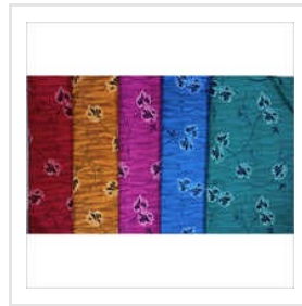
Ladies Nighty Material Fabric