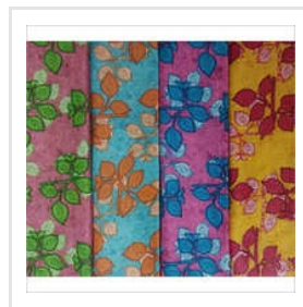
Ladies Cotton Nighty Fabric