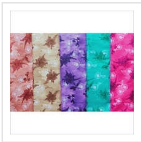
Ladies Floral Printed Nighty Fabric