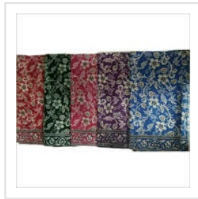
Cotton Nighty Fabrics