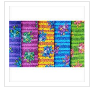
Ladies Pure Cotton Nighty Fabric