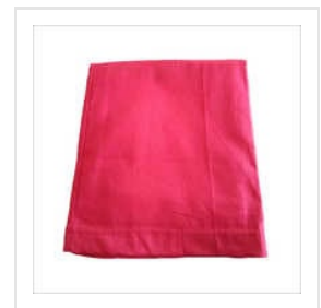
1 Inch Plain Patti Petticoat