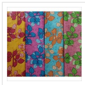
Ladies Cotton Nighty Fabrics