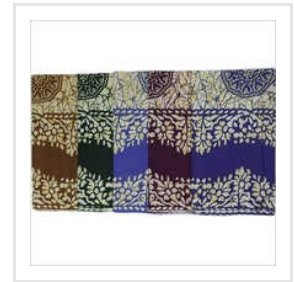
Ladies Rayon Nighty Fabric