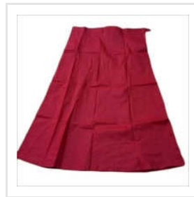
Jumbo Cotton Petticoat