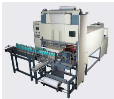
MACHINE MODEL:-ASW750-60BPM Single Line