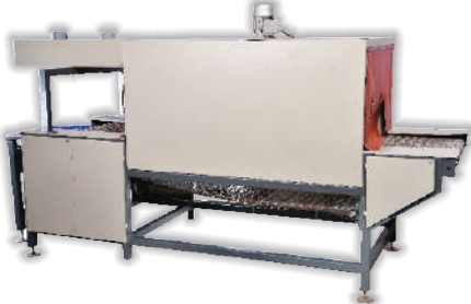
Shrink Tunnel With Wiremesh Conveyor