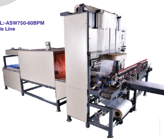
MACHINE MODEL:-ASW750-60BPM Single Line