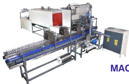
MACHINE MODEL:-ASW750-120BPM 4 Line