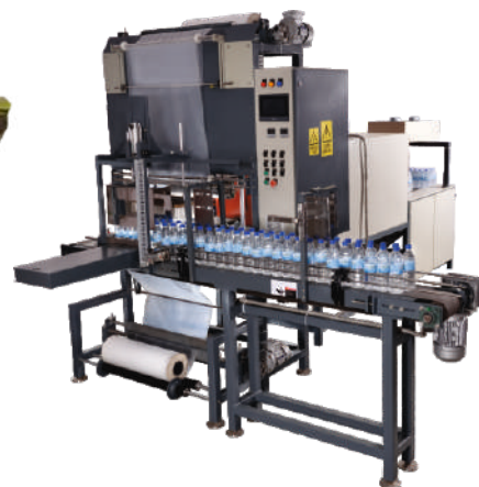
MACHINE MODEL:-ASW750-90BPM 2 Line