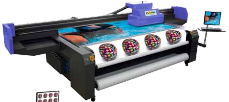
4x8 FOOT UV PRINTER WITH ROLL OPTION