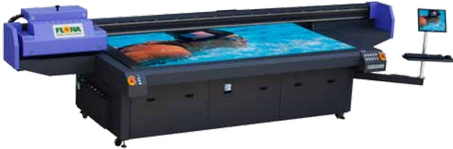
4x8 FOOT UV PRINTER