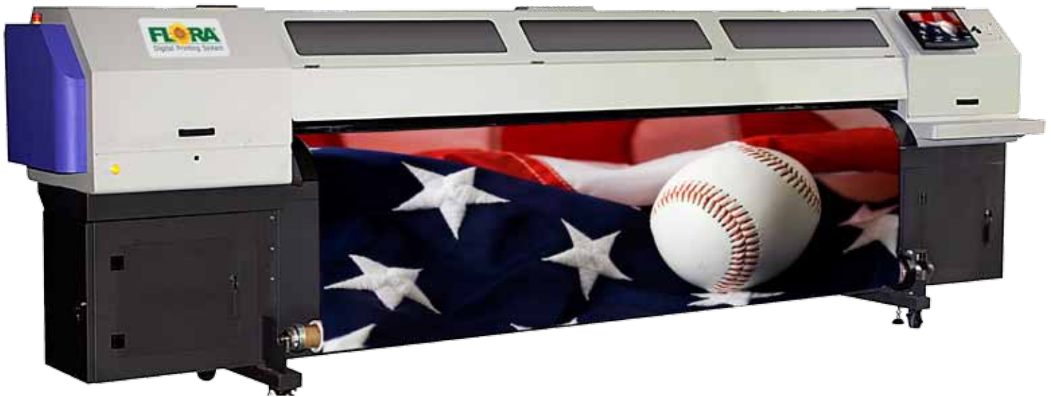
10.5 FOOT UV ROLL TO ROLL PRINTER