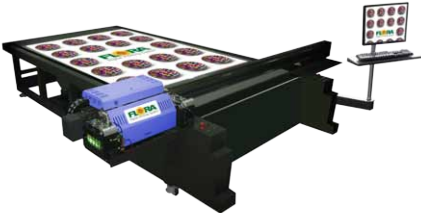
6x10 FOOT UV PRINTER