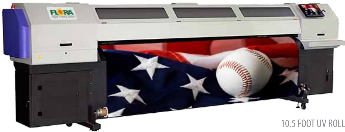
10.5 FOOT UV ROLL TO ROLL PRINTER