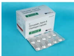
Atorvastatin And Clopidogrel Capsules