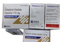
110mg Dabigatran Etexilate Capsules