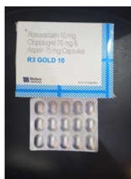
Rosuvastatin 10mg Clopidogrel 75mg