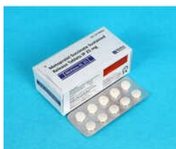
25mg Metoprolol Succinate Sustained