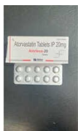
20mg Atorvastatin Tablets IP