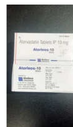
10mg Atorvastatin Tablets IP