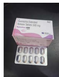
500mg Ranolazine Extended Release