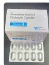
A3 Gold 20 Capsules