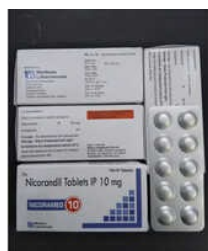
10mg Nicorandil Tablets IP