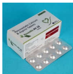
Rozastin-AV 10 Tablets