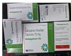
75mg Dabigatran Etexilate Capsules