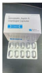
Atorvastatin And Clopidogrel Capsules