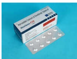
Atorvastatin Calcium 10mg And Fenofibrate