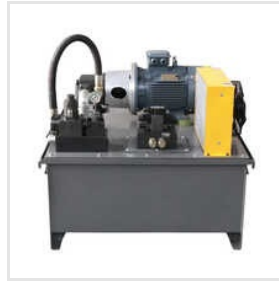
Customized Hydraulic Power Pack