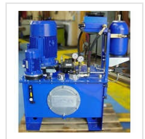
220V Hydraulic Power Pack