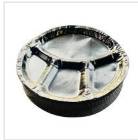
Silver Kappa Paper Thali