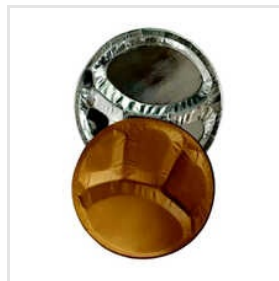
Disposable Laminated Paper Plate