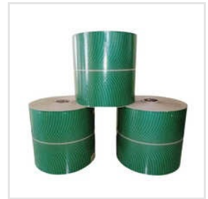
Raw Paper Thali Material