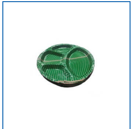
GREEN BUFFET PATRAVALI PLATE