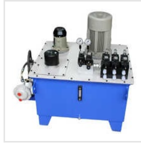
Mini Hydraulic Power Pack