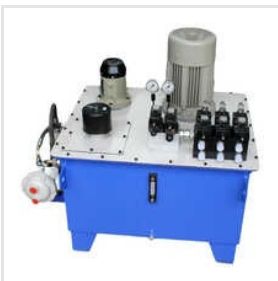
2 HP Hydraulic Power Pack