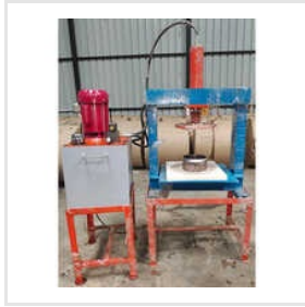
Paper Plate Circle Cutting Machine