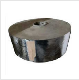
Silver Paper Plate Raw Material