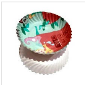
Designer Print Paper Plate