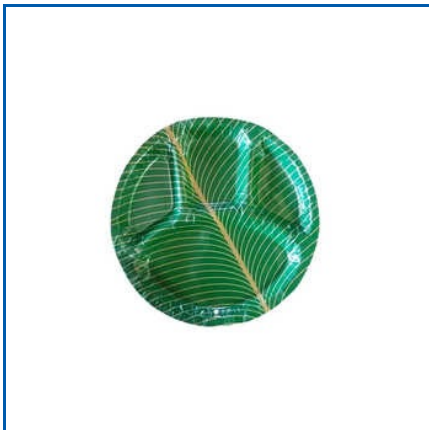
DISPOSABLE PAPER PLATE

14 Inch Printed Disposable Paper Thali, 2 HP Hydraulic Power Pack, 2 HP Hydraulic Power Pack Unit, 220V Hydraulic Power Pack, Customized Hydraulic Power Pack, Designer Print Paper Plate, Disposable Laminated Paper Plate, Disposable Paper Plate, Disposable Single Die Plate Making Machine, Dona Paper Roll, etc.