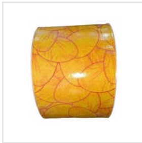
Printed Disposable Paper Raw Material