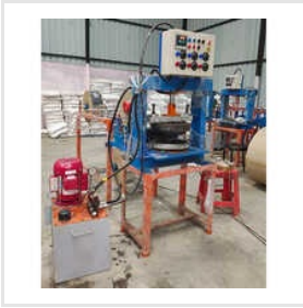
Disposable Single Die Plate Making Machine