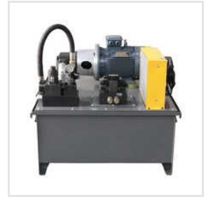
2 HP Hydraulic Power Pack Unit