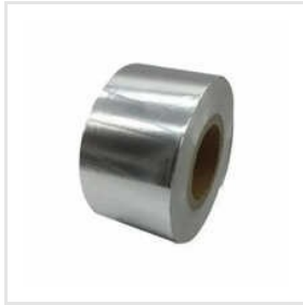
Silver Paper Plate Raw Material