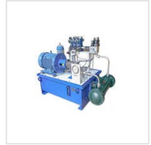
Industrial Hydraulic Power Pack