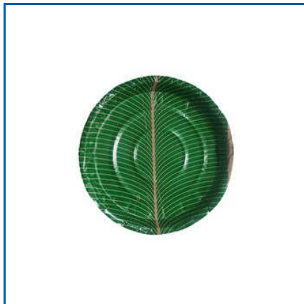
14 INCH PRINTED DISPOSABLE PAPER THALI