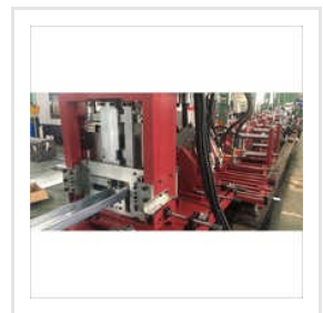
Fully Automatic CNC C Z And U Purlin Machine