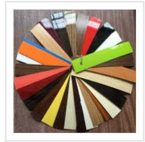
PVC Edge Band