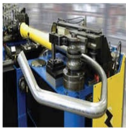
CNC PIPE BENDING MACHINE

Base Camp In Prefab, C Purlin, CNC Pipe Bending Machine, Edge Banding Tape, Fully Automatic CNC C Z And U Purlin Machine With 9 Punching Station, Galvanized Iron U Purlin, PVC Edge Band, Solar Column Post, Structural Steel Work For Base Camp, etc.