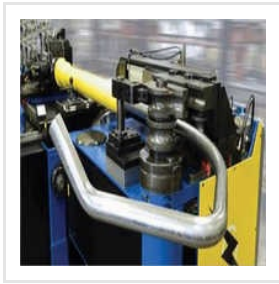
CNC Pipe Bending Machine