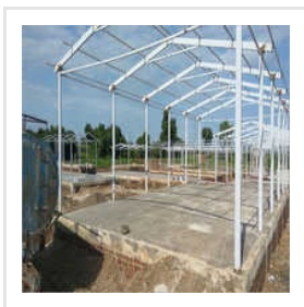
Structral Steel Work For Base Camp