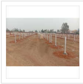
Solar Column Post