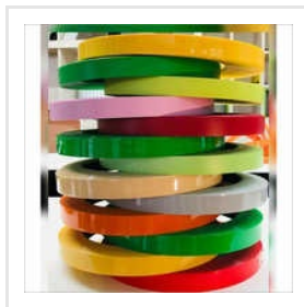
Edge Banding Tape