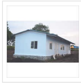
Base Camp In Prefab