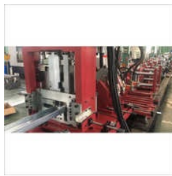
FULLY AUTOMATIC CNC C Z AND U PURLIN MACHINE WITH 9 PUNCHING STATION