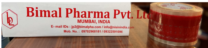
Printed Tape, with our Name & Logo, applied to seal the lids