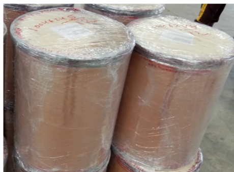
25 kgs. Fibre Drums with Shrink wrapping & Printed Tape