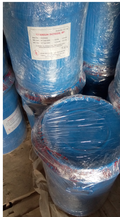
HM-HDPE Drums with Shrink wrapping & Printed Tape