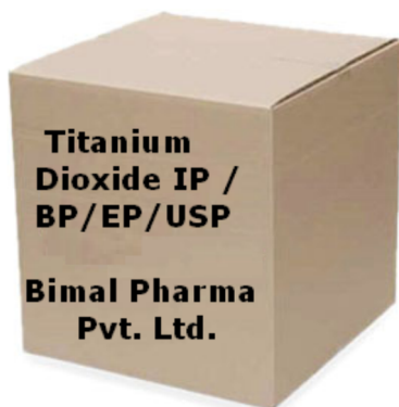
5 kgs. Carton with PE Liner inside