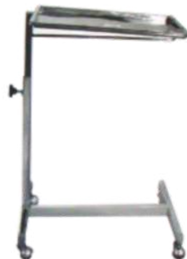
745 MAYO'S INSTRUMENT TROLLEY WITH S.S. TRAY