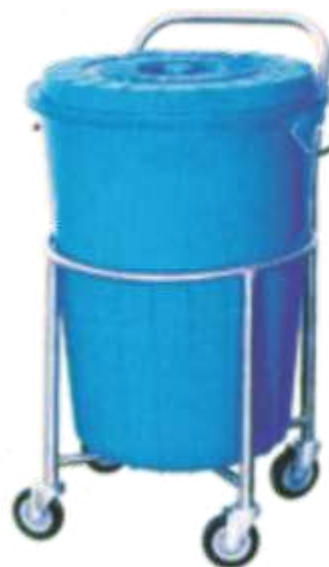
744 Solid Linen Trolley With Plastic Bucket