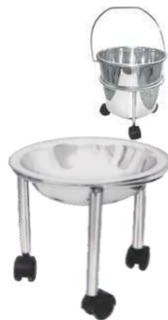
759 Kick Bowl / Bucket