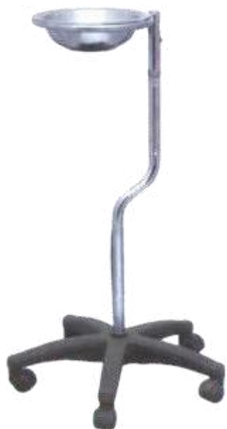
757 Wash Basin Stand (single)