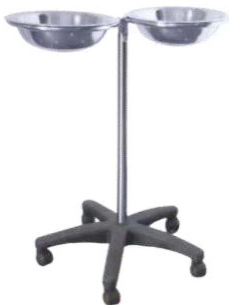
758 Wash Basin Stand (Double)