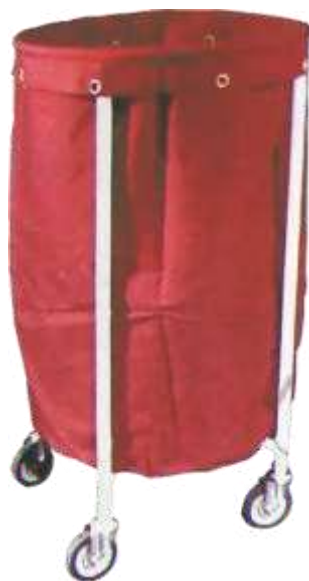
743 Soiled Linen Trolley With Canvas Bag