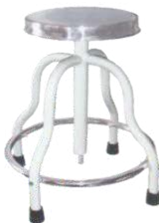
750 Revolving Stool (SS Top)