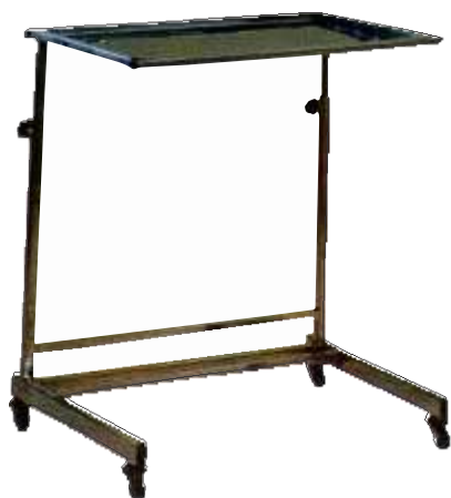
746 S.S. Mayo's Trolley

Wholly made of stainless steel, Mayo trolley, Adjustable height suitable to use over the operation table, Mounted on four 5 cm castors.