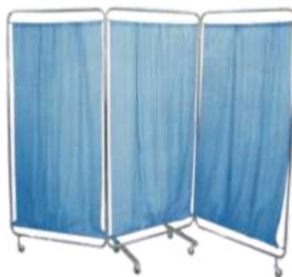
763 BED SIDE SCREEN (3 PANELS)