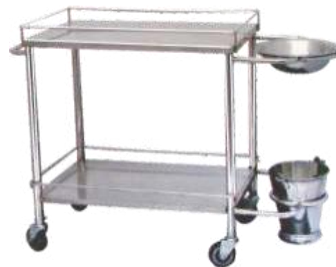
742 Dressing Trolley