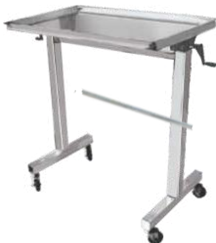
747 Instrument Mayo's Trolley Over The O.T Table (mechanically)

Wholly made of stainless steel, Mayo trolley, Adjustable height suitable to use over the operation table, Mounted on four 5 cm castors.