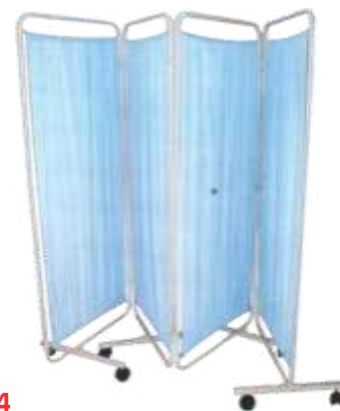
764 BED SIDE SCREEN (4 PANELS)