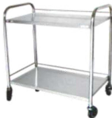
741 Instrument Trolley (Two Shelves)