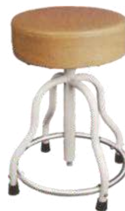
751 Revolving Stool (Cushioned Top)