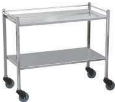
740 Instrument Trolley (Two Shelves)