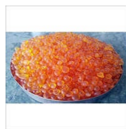
25 Kg Orange Silica Gel Granules