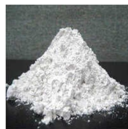
White Pure Hydrated Lime Powder