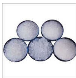
25 Kg White Silica Gel Crystal