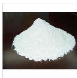
Pure Hydrated Lime Powder