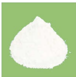
White Calcium Hydroxide