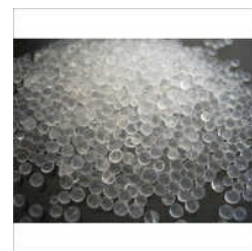
WHITE REAGENT GRADE SILICA GEL