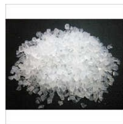
Non Indicative White Silica Gel