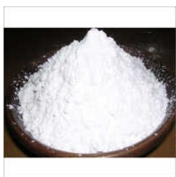
White Hydrated Lime Powder