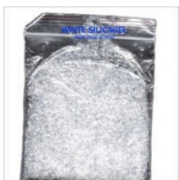
White Silica Gel Granules