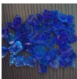
Blue Silica Gel Granules