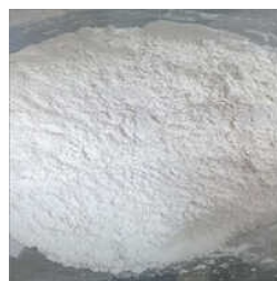
White Calcium Hydroxide