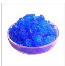
Blue Silica Gel Granules