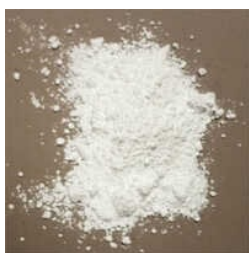
96% White Calcium Hydroxide Powder