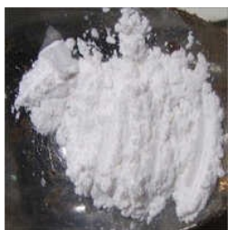
Calcium Hydroxide Powder