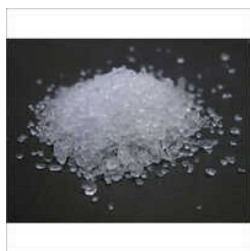
WHITE SILICA GEL GRANULES

25 Kg White Silica Gel Crystal, 25 kg Orange Silica Gel Granules, 40 Kg Calcium Hydroxide Powder, 40 Kg Hydrated Lime Powder, 96% White Calcium Hydroxide Powder, Blue Silica Gel Granules, Calcium Hydroxide Powder, Industrial Hydrated Lime Powder, Non Indicative White Silica Gel, Pure Hydrated Lime Powder, White Activated Alumina Balls, White Calcium Hydroxide, White Hydrated Lime Powder, White Limestone Powder, White Pure Hydrated Lime Powder, etc.