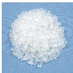
WHITE SILICA GEL CRYSTAL