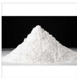
40 Kg Hydrated Lime Powder