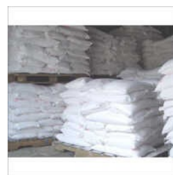
Industrial Hydrated Lime Powder