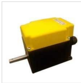
Giovenzana Rotary Limit Switch