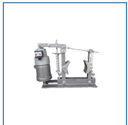
ELECTRO HYDRAULIC THRUSTER BRAKE