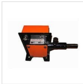
Rotary Geared Limit Switch Sheet Metal