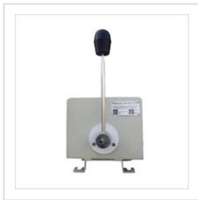
Crane Master Controller