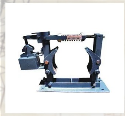
AC ELECTROMAGNETIC BRAKES