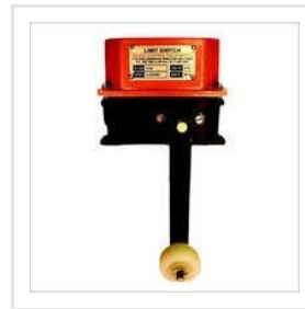
Lever Limit Switch For Crane