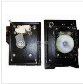
Rotary Limit Switches Internal