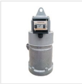
Electro Hydraulic Thruster 18Kg