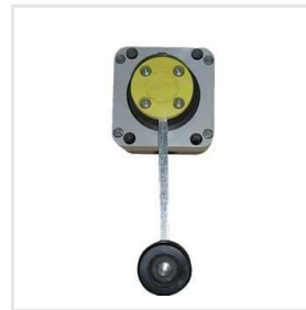
Giovenzana Lever Limit Switch