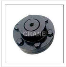
Flexible Geared Coupling