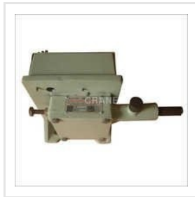
Rotary Gear Limit Switch Cast Iron Body