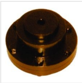
Crane Flexible Geared Couplings