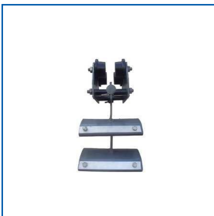
DOUBLE DECKER CABLE TROLLEY

34-114 Kg Electro Hydraulic Thruster, AC Electromagnetic Brakes, Brake Drum Coupling, Cable Trolley, Counter Weight Limit Switch, Crane Flexible Geared Couplings, Crane Master Controller, Cross Bar Limit Switch, D C Electro Magnetic Brakes, DSL Bus Bar, Double Decker Cable Trolley, Electro Hydraulic Thruster 18Kg, Electro Hydraulic Thruster Brake, Flat Type Current Collector With Assembly, Flexible Geared Coupling, etc.