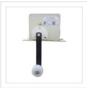
Lever Limit Switch