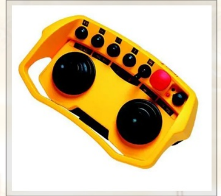
RADIO REMOTE CONTROL JOYSTICK

34-114 Kg Electro Hydraulic Thruster, AC Electromagnetic Brakes, Brake Drum Coupling, Cable Trolley, Counter Weight Limit Switch, Crane Flexible Geared Couplings, Crane Master Controller, Cross Bar Limit Switch, D C Electro Magnetic Brakes, DSL Bus Bar, Double Decker Cable Trolley, Electro Hydraulic Thruster 18Kg, Electro Hydraulic Thruster Brake, Flat Type Current Collector With Assembly, Flexible Geared Coupling, etc.