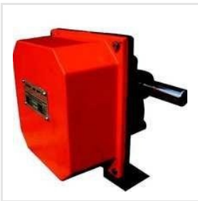
Rotary Geared Limit Switch Aluminium