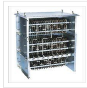
Punched Grid Resistance Box