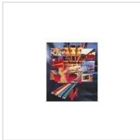
DSL Bus Bar