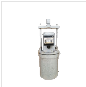
34-114 Kg Electro Hydraulic Thruster