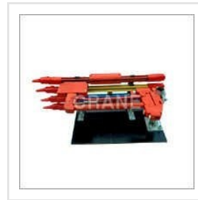
Shrouded Bus Bar Conductor