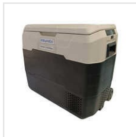
MAVT-01 Active Vaccine Transporter