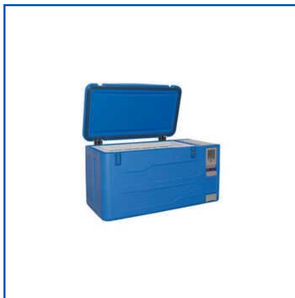
MSDD-01 SOLAR DIRECT DRIVE REFRIGERATOR