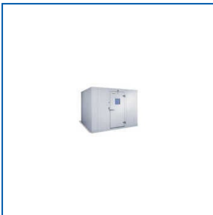
MSWF-01 SOLAR WALK IN FREEZER

-86 Degree Celsius Blast Freezer, 25224 Three Layer Face Mask, Bio Safety Cabinet, Blood Bag Tube Sealer, Blood Bank Refrigerator, Blood Collection Monitor, Digital Data Logger, Gel Card Incubator, MACL-01 Laboratory Autoclave, MAVT-01 Active Vaccine Transporter Cold Box, MBODI-02 BOD Incubator, MBODI-02 Bio Safety Cabinet, MBS-01 Bedside Screen, MBTS-01 Blood Bag Tube Stripper, MCB-01 Refrigerated Water Bath, etc.