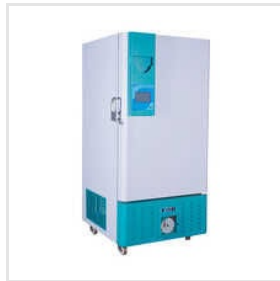
MDFU-1 -50 Degree Celsius Ultra Low