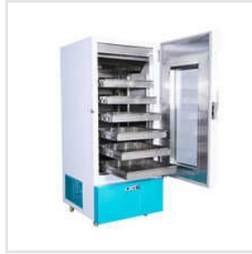
Blood Bank Refrigerator