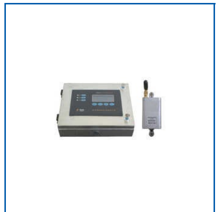
PROGRAMMABLE REMOTE TEMPERATURE MONITORING SYSTEM