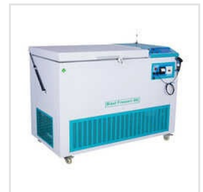
-86 Degree Celsius Blast Freezer