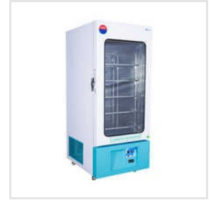
MLR-01 Laboratory Refrigerator