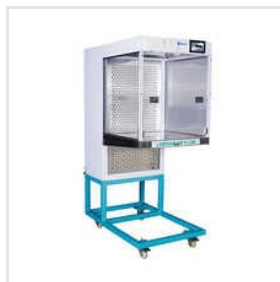
MLAF-01 Laminar Air Flow