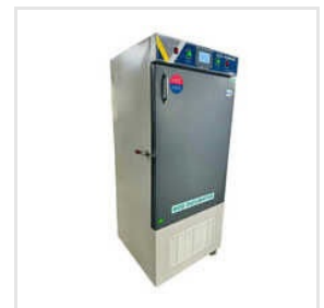
MDFU-29 Bod Incubator