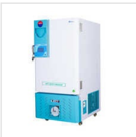
MDFU-13 -40 Degree Celsius Deep Freezer