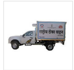
MVAN-02 Vaccine Storage Transport