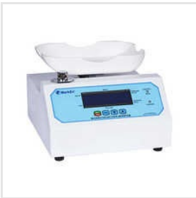
Blood Collection Monitor