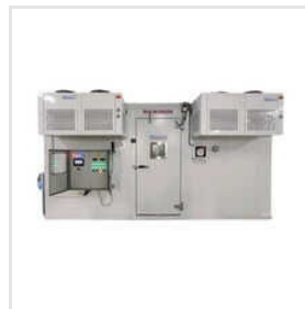
MWIC-01 Walk In Cold Room