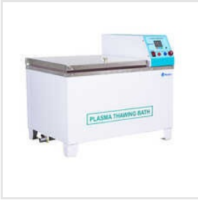
MPTB-01 Plasma Thawing Bath