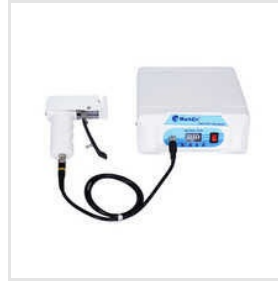
MBTS-01 Blood Bag Tube Stripper