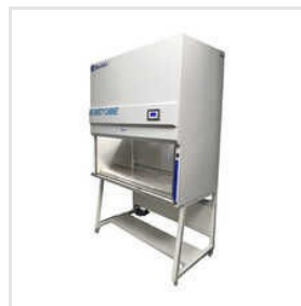
MBODI-02 Bio Safety Cabinet