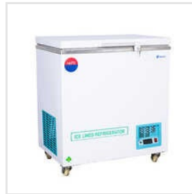
MILR-01 Ice Lined Refrigerator