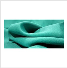
Cotton Rayon Blends Shirting Fabric