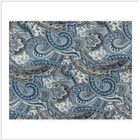
Design Jacquard Fabric