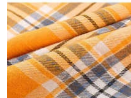
CHECKED SHIRTING FABRIC