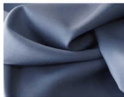
100% COTTON SHIRTING FABRIC