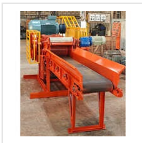
02_Industrial Biomass Drum Chipper