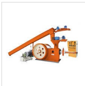
Re-90 Biomass Briquetting Machine