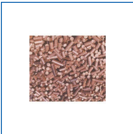
INDUSTRIAL BIOMASS BRIQUETTES

Agro waste Briquettes, Belt Conveyor a Truck Loader Mobile, Bio Coal, Bio Coal Briquetting Machine, Bio Coal Machine Spare, Bio Stove, Biogas Stove, Biomass Briquette Machine Spares, Biomass Briquettes, Biomass Briquettes Making Machine, Biomass Briquetting Machine, Biomass Briquetting Machine _ Jumbo 90, Super 60, Supreme 70, Biomass Briquetting Plant (Jumbo-90), etc.