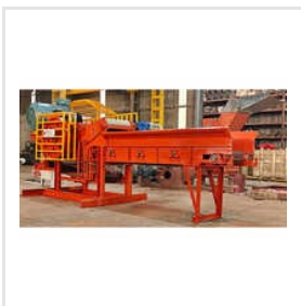
01_Industrial Biomass Drum Chipper