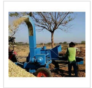
Blade Type Biomass Shredder