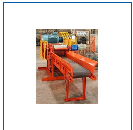
02_ INDUSTRIAL BIOMASS DRUM CHIPPER