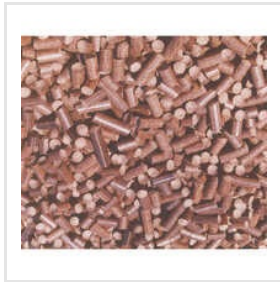
Industrial Biomass Briquettes