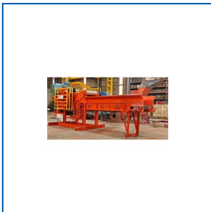
01_ INDUSTRIAL BIOMASS DRUM CHIPPER