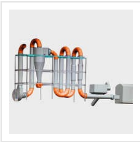
Flash Type Biomass Dryer