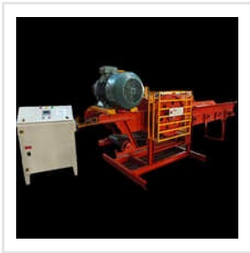
Drum Type Wood Chipper