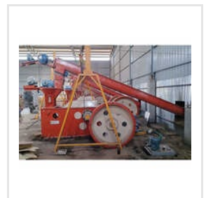
Industrial Briquetting Machine