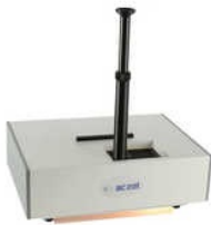
Aczet Visual Colorimeter