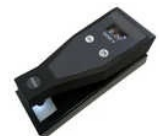
Dens V Densitometer