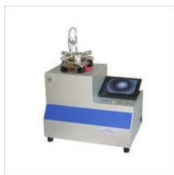
AUTOMATIC CUPPING TESTER

101 Leak Test Apparatus, 2 Shelves BOD Incubator, 20 Degree Micro Tri Gloss, 319S Dewpoint Meter, 5 KV Holiday Detector, 500C Concrete Coating Thickness Gauge, 650 B-FN Coating Thickness Gauge, 6G Coating Thickness Gauge, ABS Pin Hole Detector, APHS Benchtop pH Meter, AVM -S Vortex Mixer, Aczet Visual Colorimeter, Automatic Cupping Tester, Automatic Pull Off Adhesion Tester, B-One Plus Viscometer Lamy Rheology, etc.