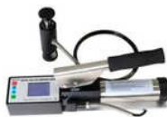
Digital Pull Off Adhesion Tester