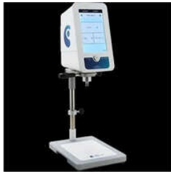
B-One Plus Viscometer Lamy Rheology