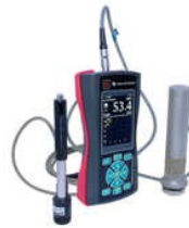
T-UD3 Combined Hardness Tester