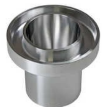
Ford Viscosity Cup