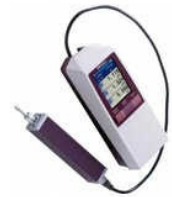
Portable Roughness Surface Tester