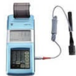
TH110 Portable Leeb Hardness Tester