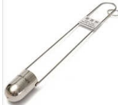
Zahn Viscosity Cup