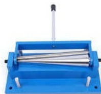
Conical Mandrel Tester