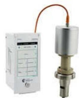
Inline Process Viscometer