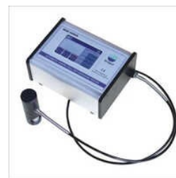
AUTOMATIC PULL OFF ADHESION TESTER