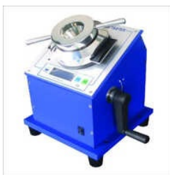
DIGITAL CUPPING TESTER