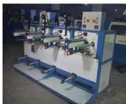
Online Bobbin Winding Machine