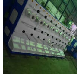
Industrial Bobbin Winding Machine