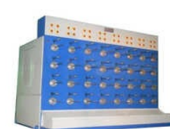
Multi Spindle Fishing Bobbin Winder