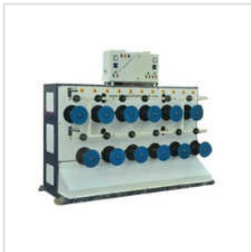
Textile Bobbin Winding Machine