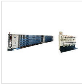
Bobbin Winding Machine