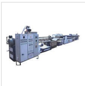
PP-HDPE Monodanline Extrusion Plant