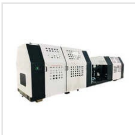
12 To 24 Mm Rope Making Machine