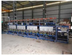
Online Coil Winding Machine