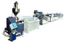
PP-HDPE Tape Fibrillated Extrusion