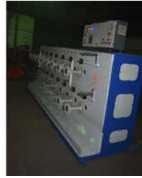
Yarn Twisting Machine