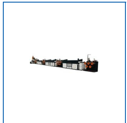
NYLON MONOFILAMENT EXTRUSION PLANT