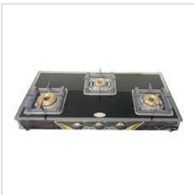
Three Burner Triple Cook Gas Stove