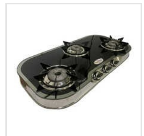
Future Flame 3 Burner Glass Top Gas Stove