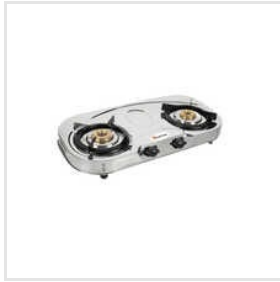
Two Burner Glen Gas Stove