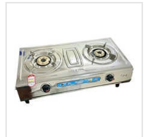
Surya Stainless Steel 2 Burner Gas Stove