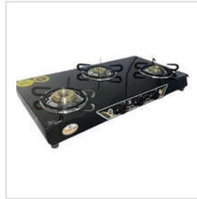
Future Flame Modular 3 Burner Gas Stove