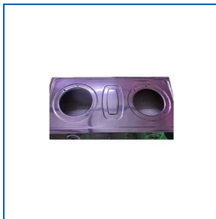
STAINLESS STEEL LPG GAS STOVE BODY