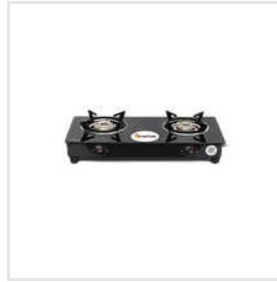
Two Burner Lpg Stove