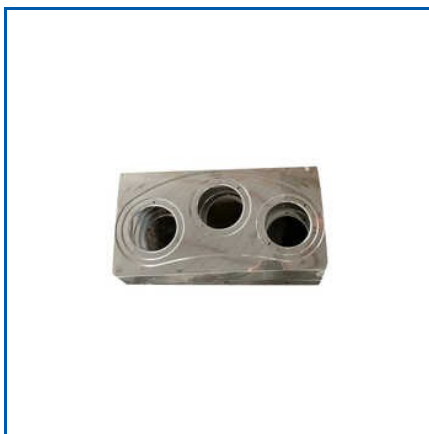
3 BURNER LPG GAS STOVE BODY

2 Burner Pigeon Lpg Gas Stove, 3 Burner Doubledecker Gas Stoves, 3 Burner LPG Gas Stove Body, Brass Gas Burner, Cast Iron Pan Support, Future Flame 2 Burner Stainless Steel Gas Stove, Future Flame 3 Burner Gas Stove, Future Flame 3 Burner Glass Top Gas Stove, Future Flame Four Burner Glass Top Gas Stove, Future Flame Glass Top 2 Burner Gas Stove, Future Flame Modular 3 Burner Gas Stove, Future Flame Three Burner Gas Stove, Future Surya Three Burner Gas Stove, Gas Stove Body, Gas Stove Dip Tray, etc.