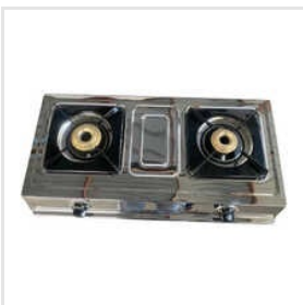
Stainless Steel Two Burner Gas Stove