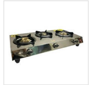
Future Flame 3 Burner Gas Stove