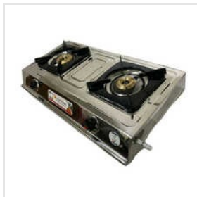
Future Flame 2 Burner Stainless Steel Gas