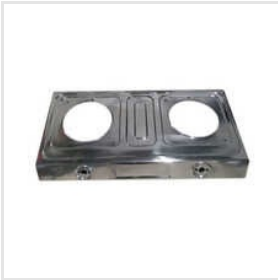
LPG Cooking Gas Stove Body