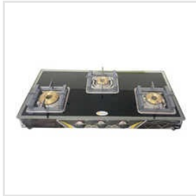
Future Flame Three Burner Gas Stove