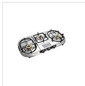
3 Burner Doubledecker Gas Stoves