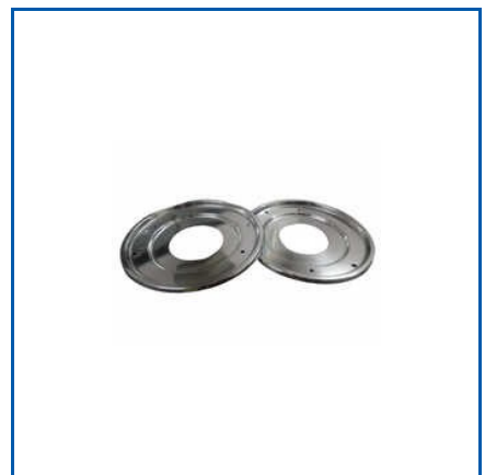
GAS STOVE DIP TRAY