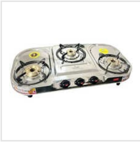
Future Surya Three Burner Gas Stove