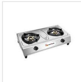
2 Burner Piegion Lpg Gas Stove