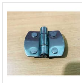
3mm SS Hinge