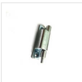
70mm MS Hinge