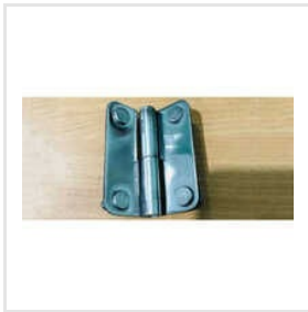
3mm SS Hinges