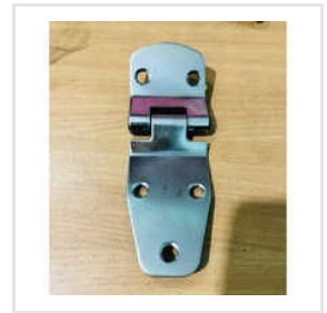
HN019 Gypsy Hinges