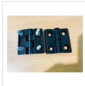
50mm Casting Hinge