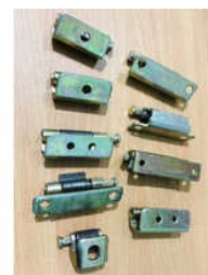
3MM PANEL HINGES