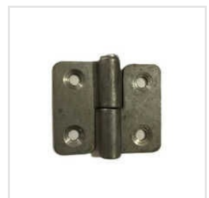
MS Canopy Hinge