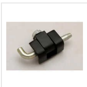
Panel Pin Type Hinge