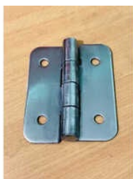
80X100MM SS HINGE

3mm Panel Hinges, 3mm Rittal Hinge, 3mm SS Hinge, 3mm SS Hinges, 40mm Casting Hinge, 50mm Casting Hinge, 50mm MS Panel Hinge, 60mm MS Panel Hinge, 70mm MS Hinge, 70mm MS Panel Hinge, 80mm Casting Hinge, 80x100mm SS Hinge, 90mm MS Panel Hinge, Big Canopy Locks, Black Pocket Handle, etc.