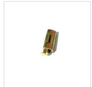
50mm MS Panel Hinge