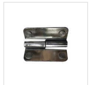
SS Hinge For Door