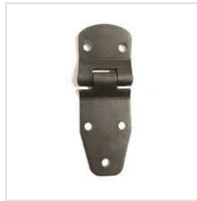
MS Gypsy Hinges