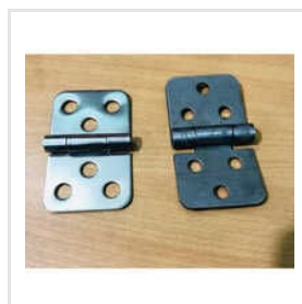
MS Hinges For Dooe