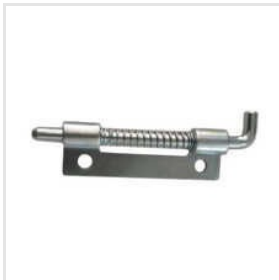
MS Spring Hinge