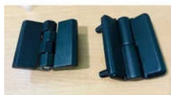
80MM CASTING HINGE