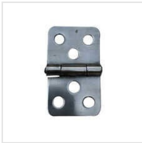
Canopy SS Hinges