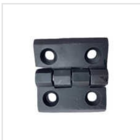
Canopy Die Cast Hinges