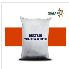
Yellow And White Dextrin