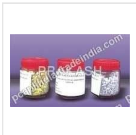
Aluminum Chloride Anhydrous