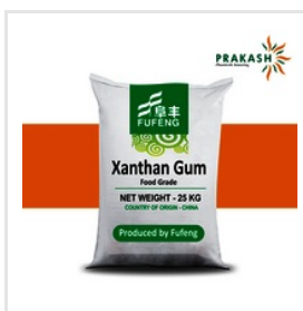
Xanthan Gum Powder