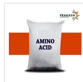
Amino Acid Powder