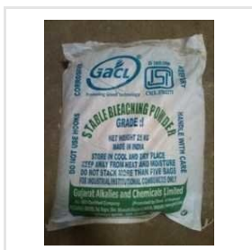
Stable Bleaching Powder