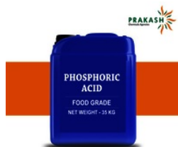
PHOSPHORIC ACID FOOD GRADE

Acetic Acid, Acetonitrile, Acrylamide Powder, Acrylic Acid, Aluminium Chloride, Aluminum Chloride Anhydrous, Amino Acid Powder, Aspartame Powder, Benzaldehyde Powder, Benzaldehyde powder, Benzyl alcohol, Benzyl chloride, Butyl Acrylate, Caustic Potash Flakes, Caustic Potash Lye, etc.