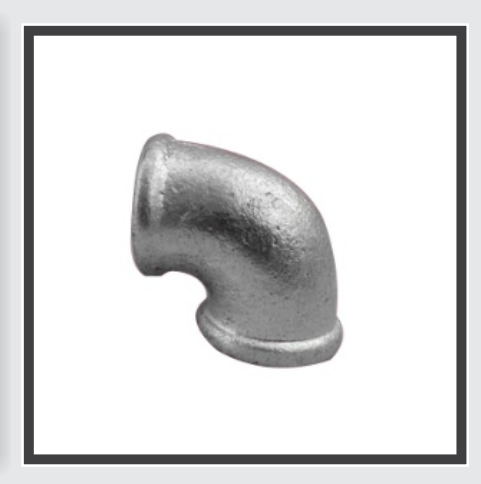
Pipe Fittings For Export