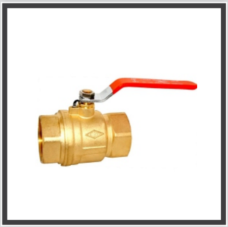
Kirti Forged Brass Ball Valve