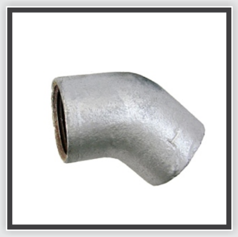
45 Degree Elbow