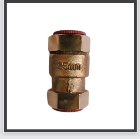
Gun Metal Vertical Check Valve