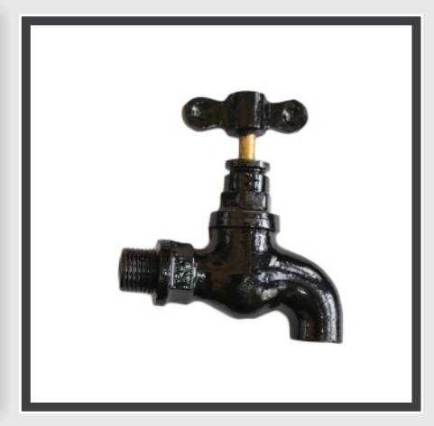
Cast Iron Bib Cock