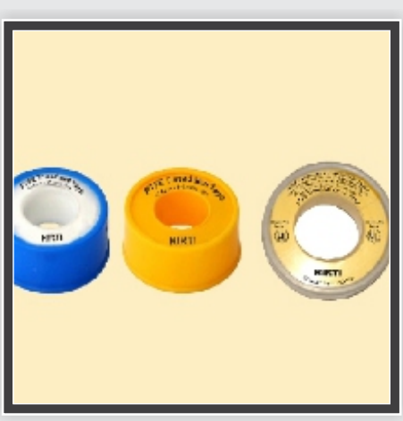
PTFE Thread Seal Tapes