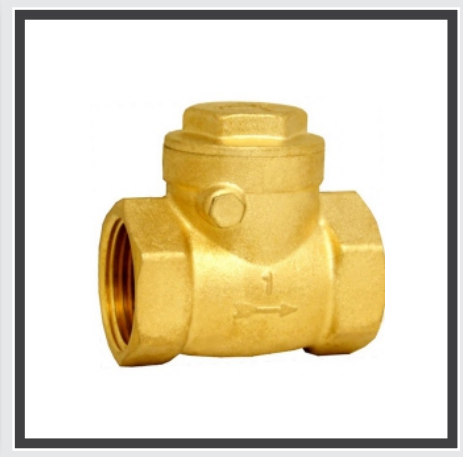
Kirti Forged Brass Swing Check Valve