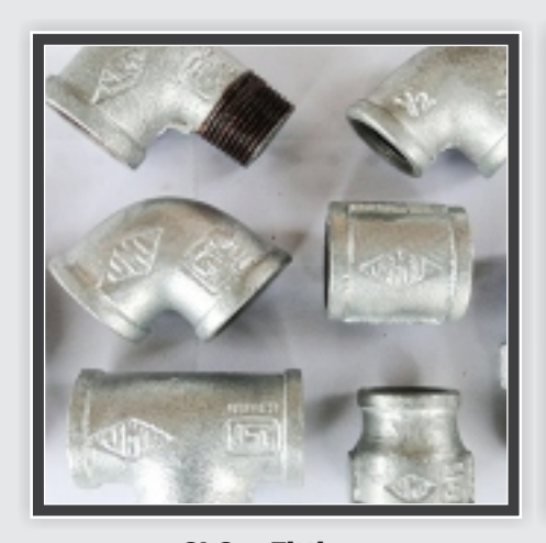
GI Gas Fittings