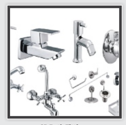
CP Bath Fittings