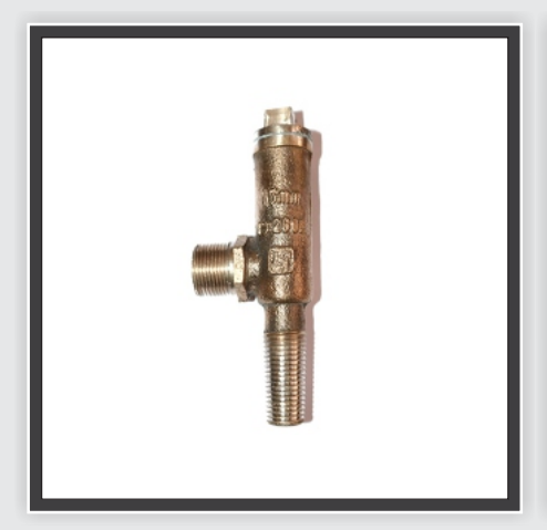
Gun Metal Ferrule Cock