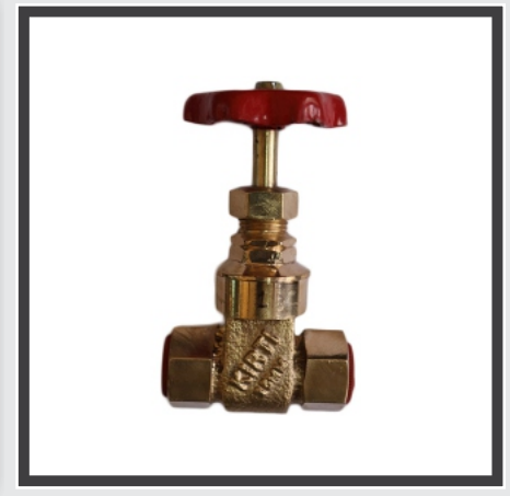
Gun Metal Valves & Cocks -As Per Is 773 Standard