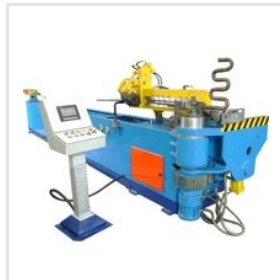
CNC Booster Bender