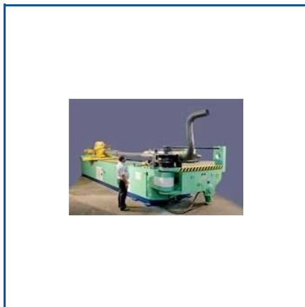
CNC THREE AXES PIPE BENDING MACHINE