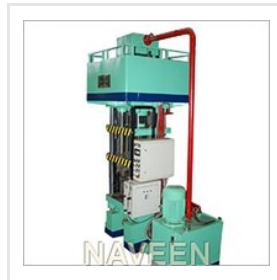
NC Controlled Hydraulic Power