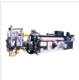
Five Axes Pipe Bending Machine