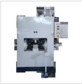
Two Station End Forming