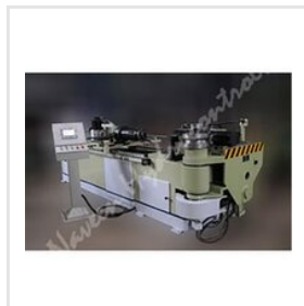
Industrial CNC Wire Bending Machine