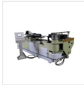
Two Axes Pipe Bending Machine