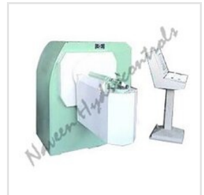
Wire Bending Machine