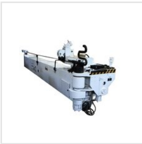
CNC Tube Benders