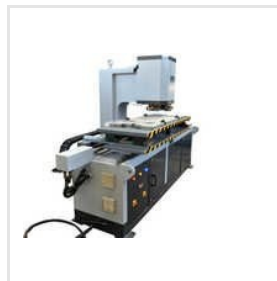
Flange Reveting Machine