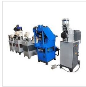
Tube End Forming Machines