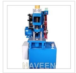
Tube End Bedding Machine