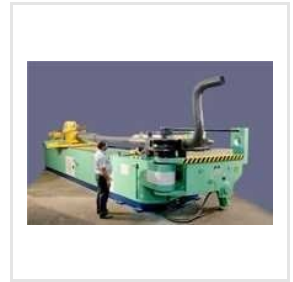
CNC Three Axes Pipe Bending Machine