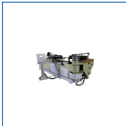
TWO AXES PIPE BENDING MACHINE