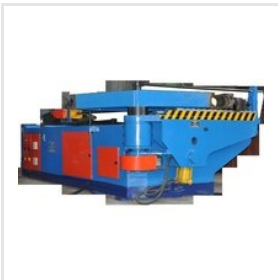
Single Axis Pipe Bending Machine