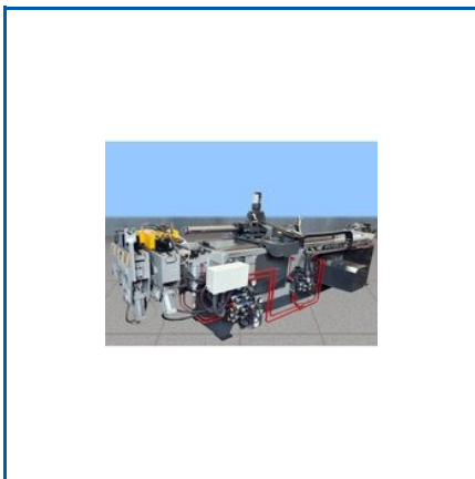
THREE AXES PIPE BENDING MACHINE

Beading Machine, CNC Booster Bender, CNC Three Axes Pipe Bending Machine, CNC Tube Benders, Five Axes Pipe Bending Machine, Flange Reveting Machine, Flange Riveting Machine, Industrial CNC Wire Bending Machine, NC Controlled Hydraulic Power Presses, Single Axes Pipe Bending Booster, Single Axis Pipe Bending Machine, Three Axes Pipe Bending Machine, Tube End Bedding Machine, Tube End Forming Machines, Two Axes Pipe Bending Machine, etc.