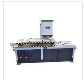
Flange Riveting Machine