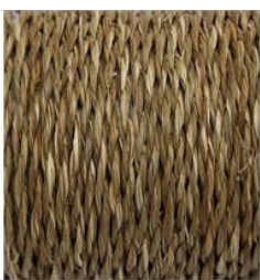
10 MM Hand Spun 3 Ply Sabai Grass Rope