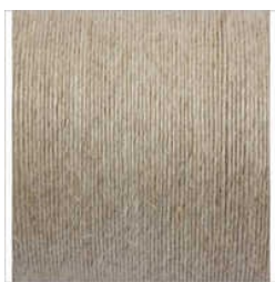
0.75 Lea Flax Yarn