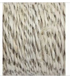
Hand Spun Jute 2 Ply Yarn