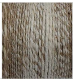
Hand Spun Jute Yarn 2 Ply Gray And Bleach