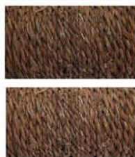
5 MM Hand Spun Rope