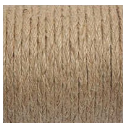
6 MM MILL SPUN MACHINE BRAIDED JUTE YARN

0.75 Lea Flax Yarn, 1 MM Mill Spun Banana Fibre Yarn, 10 MM Hand Spun 3 Ply Sabai Grass Rope, 3 MM Hand Spun Rope, 3 Strand Jute Yarn, 4 MM 3 Strand Jute Yarn, 5 MM 4 Strand Hand Twisted Jute Rope, 5 MM Hand Spun Rope, 6 MM Mill Spun Machine Braided Jute Yarn, 6mm 2 Ply Hand Spun Kenaf Yarn, Abaca Fiber, Abaca Yarn, Bamboo Basket, Banana Pith Yarn, Banana Yarn, etc.