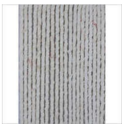
Recycled Cotton Fabric Yarn