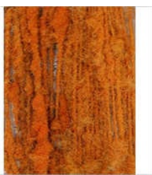
Hand Spun Recycled Silk Yarn