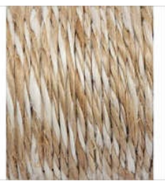
Hand Spun 3 Ply Loose Blended Yarn