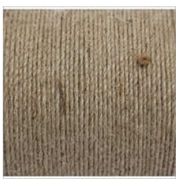
4 MM 3 Strand Jute Yarn