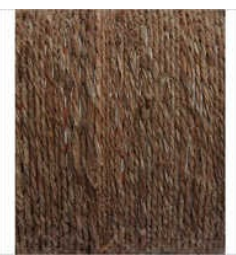
3 MM Hand Spun Rope