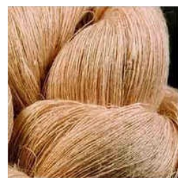
Pineapple Fiber Yarn