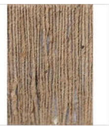
Mill Spun Jute 1 Ply Yarn