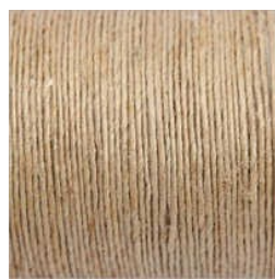
Waxed Jute Yarn For Labels