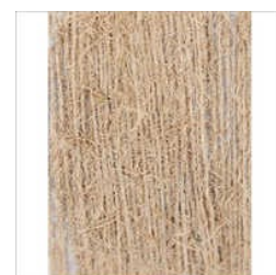
1 MM MILL SPUN BANANA FIBRE YARN