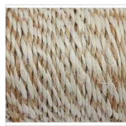
Natural Gold And Bleach 2 Ply Jute Yarn