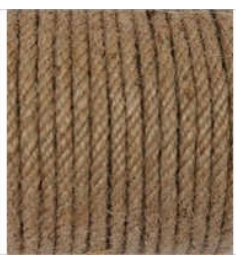
5 MM 4 Strand Hand Twisted Jute Rope