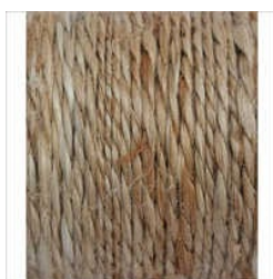
HAND SPUN GOLDEN 2 PLY JUTE YARN