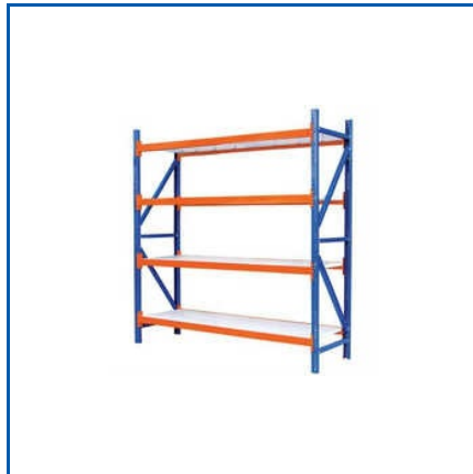
INDUSTRIAL MEDIUM DUTY PALLET RACK