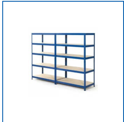
INDUSTRIAL SLOTTED ANGLE RACK