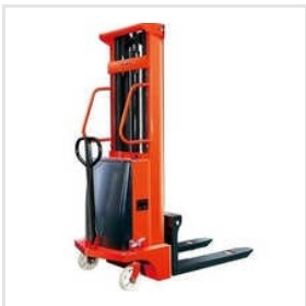
Semi Electric Stacker