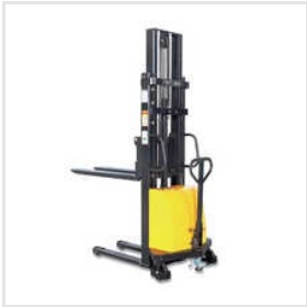
Semi Electric Straddle Leg Stackers