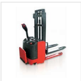
Powered Pallet Stacker