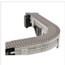
Modular Conveyor Belt