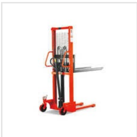
Standard Manual Stacker