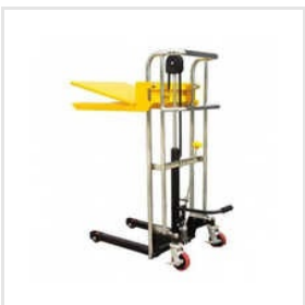
Manual Platform Stacker