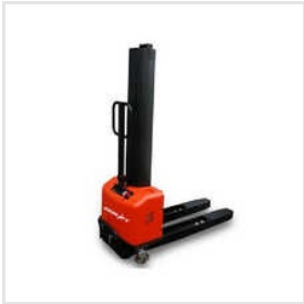
Self Lifting Stacker