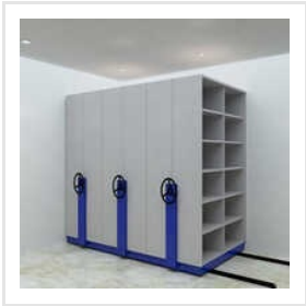
Industrial Mobile Compactor