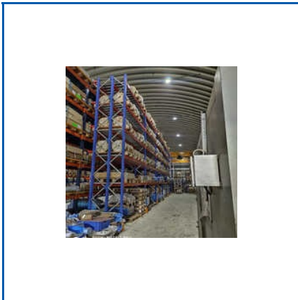
INDUSTRIAL HEAVY DUTY STORAGE RACK

Customized Mezzanine Floor, Industrial Belt Conveyors, Industrial Cantilever Rack, Industrial Dock Leveler, Industrial Goods Lift, Industrial Heavy Duty Storage Rack, Industrial Medium Duty Pallet Rack, Industrial Mobile Compactor, Industrial Multi-Tier Shelving System, Industrial Scissor Lift, Industrial Slotted Angle Rack, Manual Platform Stacker, Manual Straddle Leg Stackers, Modular Conveyor Belt, Modular Plastic Belt Conveyors, etc.