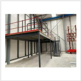
Customized Mezzanine Floor