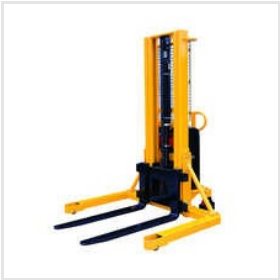
Manual Straddle Leg Stackers