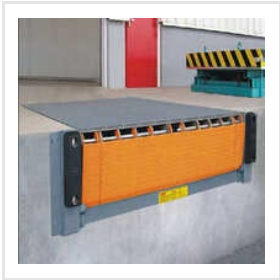
Industrial Dock Leveler