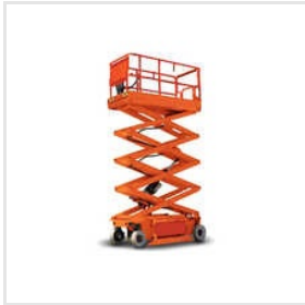
Industrial Scissor Lift