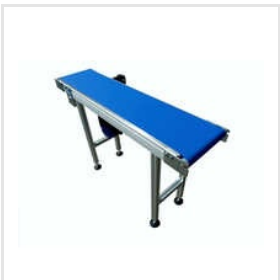
Industrial Belt Conveyors