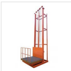
Industrial Goods Lift