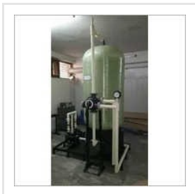
Water Ro Plant