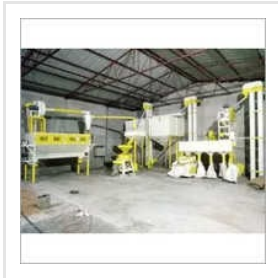
Commercial Flour Making Machine