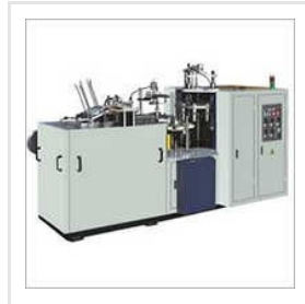
Automatic Plate Making Machine