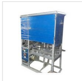
Dona Making Machine