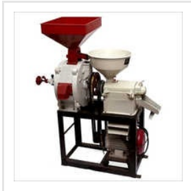
Rice Packing Machine