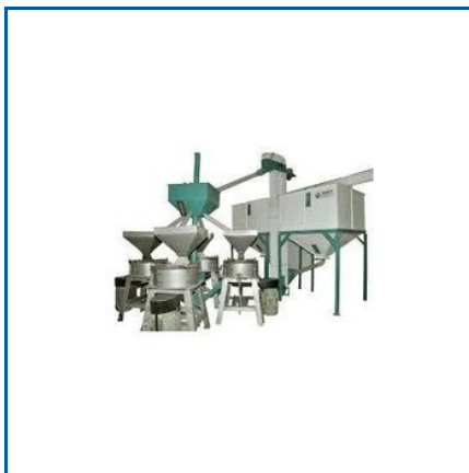
FLOUR MILL PLANT 1TON /HR

Automatic Mini Rice Machine, Automatic Plate Making Machine, Automatic Sambrani Making Machine, Commercial Flour Making Machine, Flour Mill Plant 1ton /hr, Flour Mill Plant 500kg /hr, Industry Plate Making Machine, Pulverizer Rice Machine, Rice Packing Machine, Spice Pulverizer Machine, Small Flour Making Machine, Water Ro Plant, Dona Making Machine, Etc.