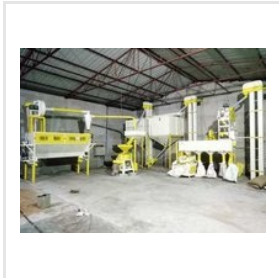
FLOUR MILL PLANT 500kg /HR