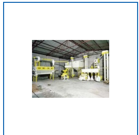
FLOUR MILL PLANT 500KG /HR