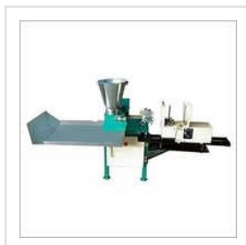
Automatic Sambrani Making Machine