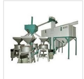
FLOUR MILL PLANT 1TON /HR