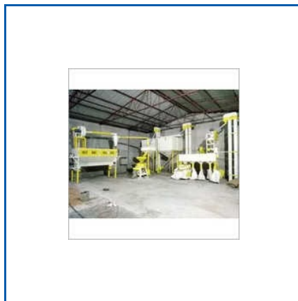
COMMERCIAL FLOUR MAKING MACHINE