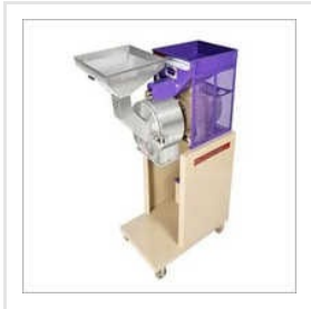
Pulverizer Rice Machine