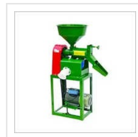
Automatic Mini Rice Machine