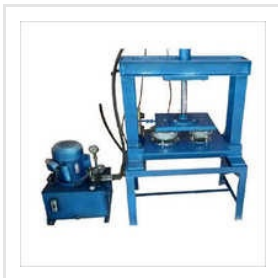
Industry Plate Making Machine