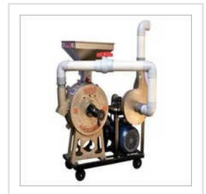
Small Flour Making Machine