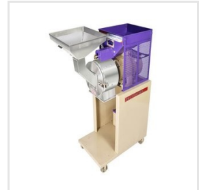
SPICE PULVERIZER MACHINE