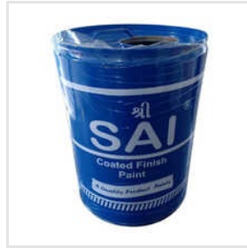
Epoxy High Built Zinc Phosphate Primer