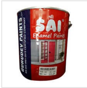
Red Oxide Metal Primer