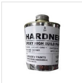
PU Aeromatic Paint