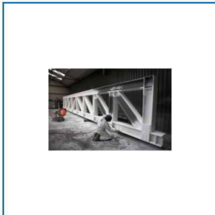
EPOXY MIO PRIMER