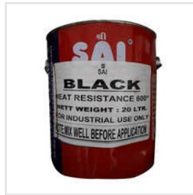
Epoxy Solvent Less Tank Liner