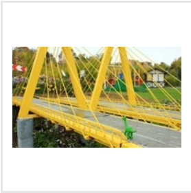
Zinc Chormate Yellow Primer