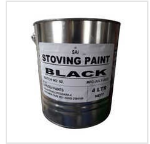
Epoxy Zinc Rich Primer