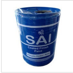
Zinc Chormate Yellow Primer