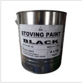
Zinc Chormate Red Primer