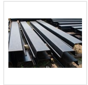
Epoxy Coal Tar Paint