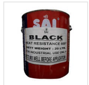
Fast Drying Paint