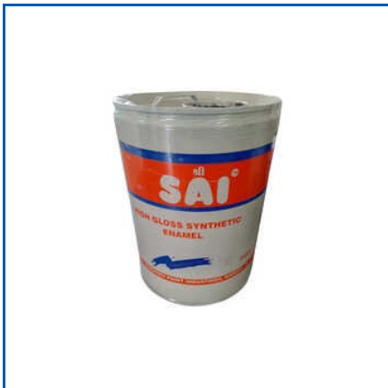
EPOXY PENETRATING PRIMER

Auto Paint, Coated Finish Paint, Direct To Metal Paint, Distemper Paint, Epoxy Coal Tar Paint, Epoxy High Built Zinc Phosphate Primer, Epoxy Mio Primer, Epoxy Penetrating Primer, Epoxy Red Oxide Primer, Epoxy Solvent Less Tank Liner, Epoxy Thinner, Epoxy Zinc Rich Primer, Fast Drying Paint, G P Thinner, Metal Paint, etc.