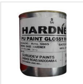
PU Aliphetic Paint