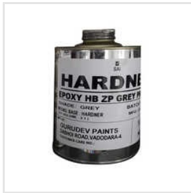
Epoxy Red Oxide Primer