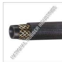
BLACK WATER HOSE