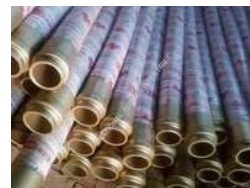
Concrete End Hose