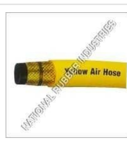
Yellow Air Hose