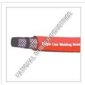
Single Line Welding Hoses