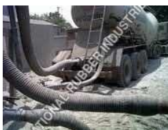
FLY ASH HOSES