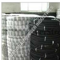
OIL HOSE WITH FABRIC INSERTION

Air & Water Suction Hose, Air – Rock Drill Rubber Hose, Air Water Hose, Black Water Hose, Braided Hydraulic Hoses, CR Rubber Sheet, Car Heater Hose, Carbon Free Hose, Checkered Rubber Sheet, Chemical Hose, Concrete End Hose, EPDM Rubber Sheet, Extrusion Type Compressor Air Hose, Flat Ribbed Rubber Sheet, Flat Rubber Sheet, etc.