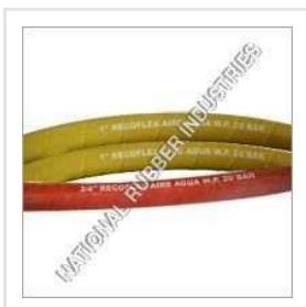
Air Water Hose