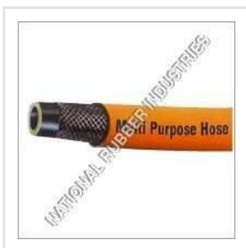
Multi Purpose Hose