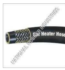
Car Heater Hose