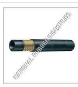
Wire Braid Hydraulic Hose