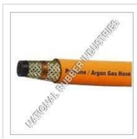
Propane Argon Gas Hose