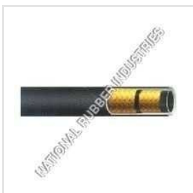
Braided Hydraulic Hoses