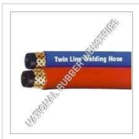
Twin Line Welding Hose