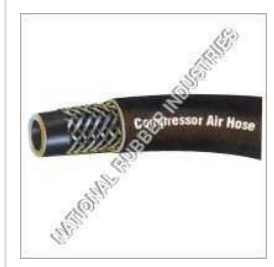
Extrusion Type Compressor Air Hose