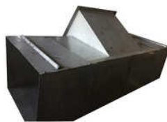
STAINLESS 304 STEEL DUCTING