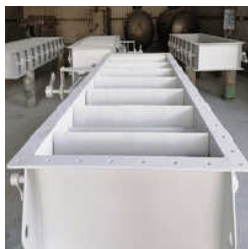
Industrial Multilouver Damper