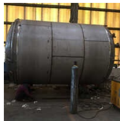
Industrial Stainless Steel Tank With Limpet