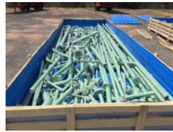
Industrial Piping Loop