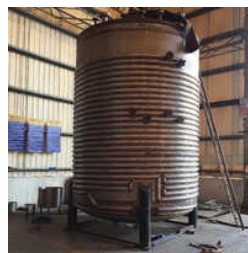
Vertical Stainless Steel Tank With Limpet Coil