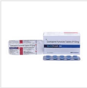
50 MG Quetiapine Fumarate Tablets IP