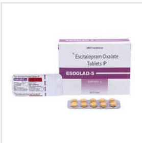
5 MG Escitalopram Oxalate Tablets IP