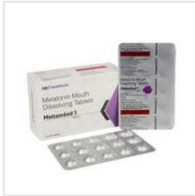
5 MG Melatonin Mouth Dissolving Tablets