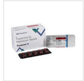
Flupentixol And Melitracen Tablets