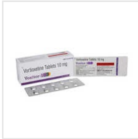
10 MG Vortioxetine Tablets