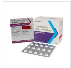
500 MG Levetiracetam Tablets IP