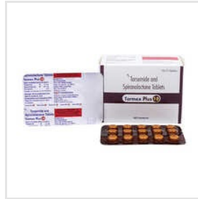
10 MG Torsemide And Spiro lactone Tablets