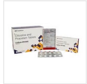
Citicoline AND Piracetam Tablets