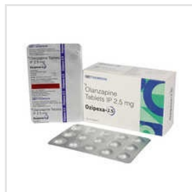
2.5 MG Olanzapine Tablets IP