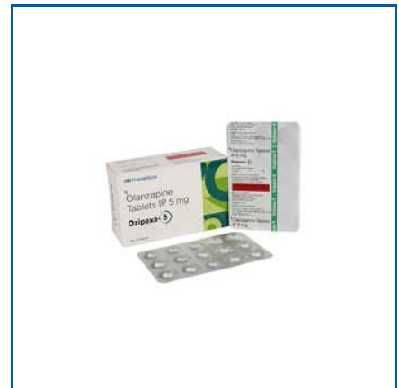
5 MG OLANZAPINE TABLETS IP