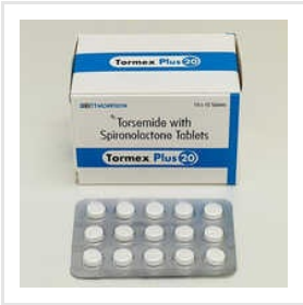
20 MG Torsemide And Spiro lactone Tablets