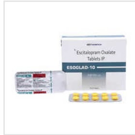
10 MG Escitalopram Oxalate Tablets IP