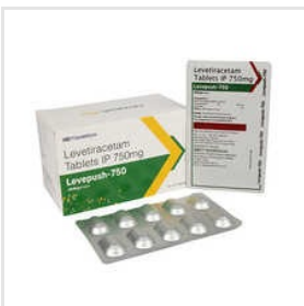
750 MG Levetiracetam Tablets IP