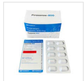
800 MG Piracetam Tablets