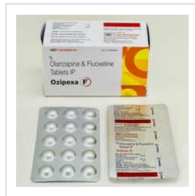
Olanzapine Tablets IP