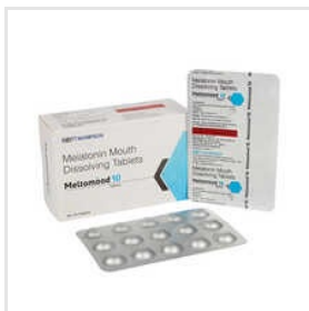
10 MG Melatonin Mouth Dissolving Tablets