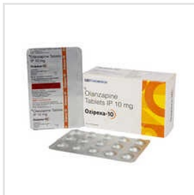
10 MG Olanzapine Tablets IP