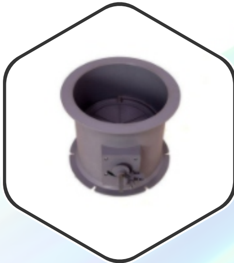
PP Duct Damper