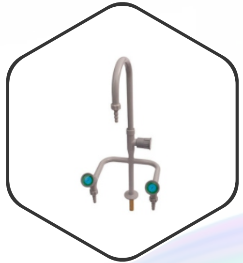
3 Way Water Taps