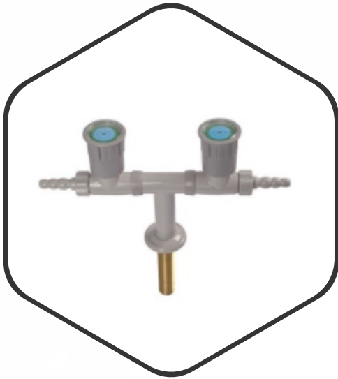
2 Way Taps