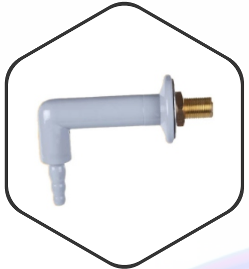
90° Elbow with Accessories