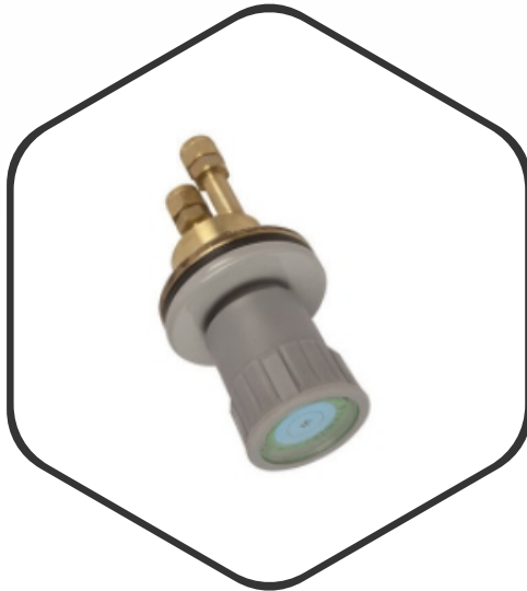
Panel Mounted Remote Valve