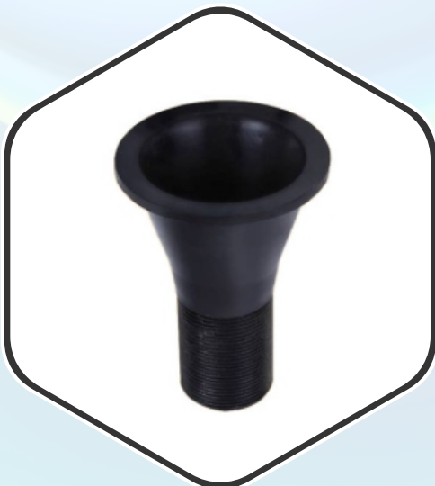
6 Cup Sink