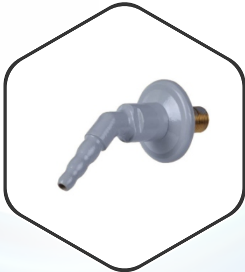
45° Nozzle with Accessories