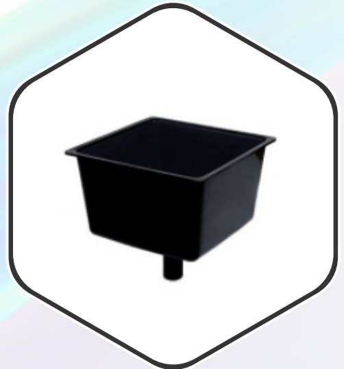
PP Square Sink