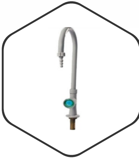
Single Way Goose Neck Water Taps