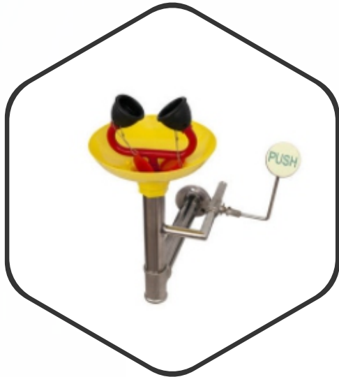
Wall Mounted Eye Wash