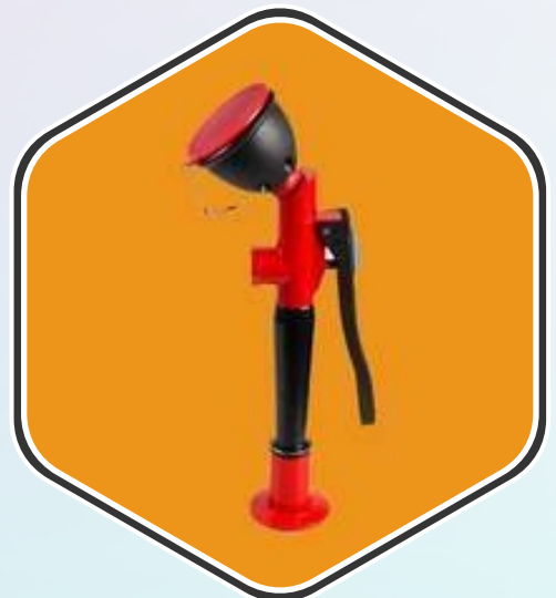
Single Eye Wash