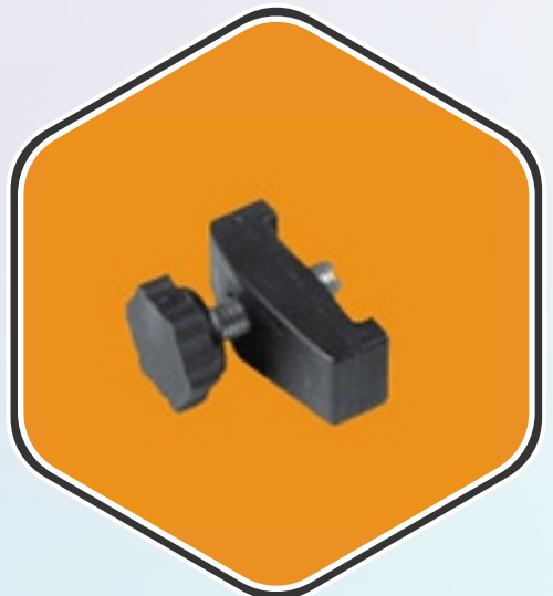
Panel Lock Knob