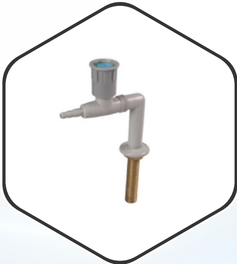
Single Cone Taps