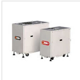
Semiconductor Dry Vacuum Pumps