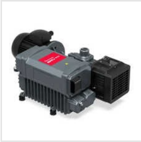
Single Stage Rotary Vane Vacuum Pump