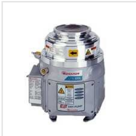
Mechanical Booster Pumps