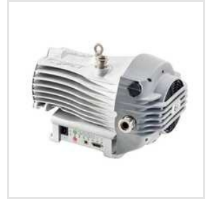
Dry Scroll Vacuum Pumps