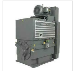
Rotary Piston Vacuum Pumps