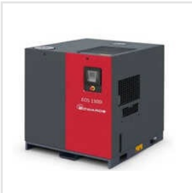
Rotary Screw Vacuum Pumps