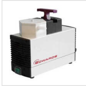
Oil-Free Diaphragm Vacuum Pumps