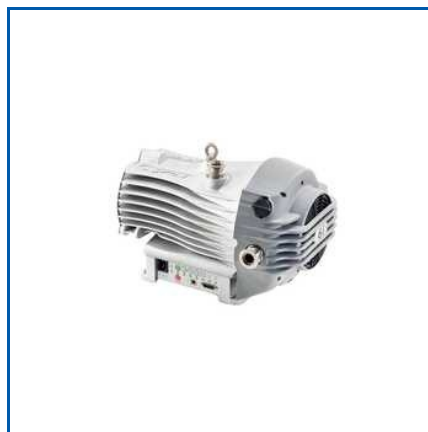
DRY VACUUM PUMPS