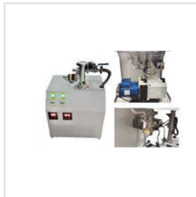
Diffusion Pumping Stations