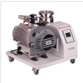
Turbomolecular Pumping Stations