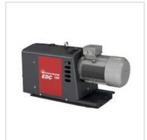
Dry Claw Vacuum Pumps