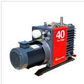
Double Stage Rotary Vane Vacuum Pump