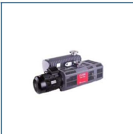
OIL SEALED ROTARY VACUUM PUMPS

Air Admittance Valve, Ball Valves, Butterfly Valves, Chemical Dry Vacuum Pumps, Deposition Controllers, Diffusion Pumping Stations, Diffusion Pumps, Double Stage Rotary Vane Vacuum Pump, Dow Corning High Vacuum Silicon Grease, Dry Claw Vacuum Pumps, Dry Scroll Vacuum Pumps, Dry Vacuum Pumping Stations, Dry Vacuum Pumps, Evaporation Boats, Filaments, etc.