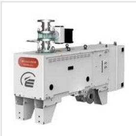
Chemical Dry Vacuum Pumps