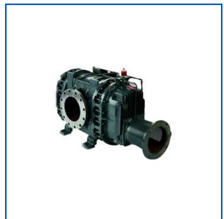
MECHANICAL BOOSTER PUMPS