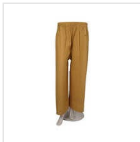
Makai Reyon Palazzo