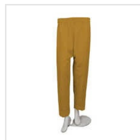
Cotton Chikankari Palazzo