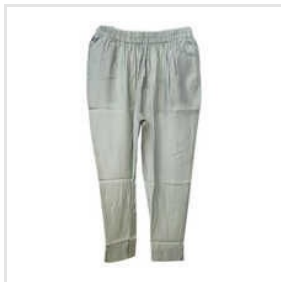
Ladies Silk Pant