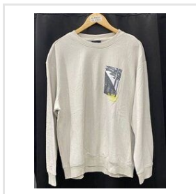
Sweatshirt Surplus H&M