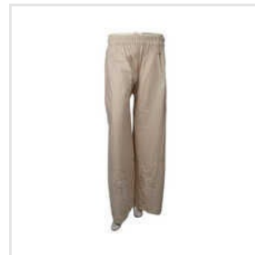
Applique Embroidery Pant