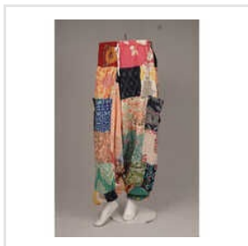
Multicolor - Block Printed Handmade