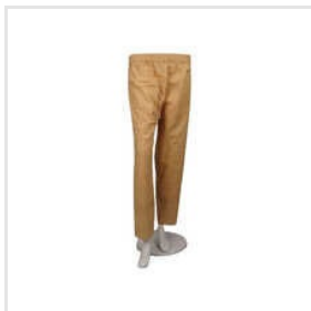
Makkhan Boring Palazzo