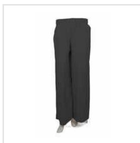
3XL Ladies Palazzo