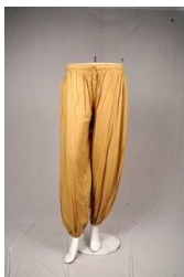
LADIES HAREM PANT

22 GSM Nandi Reyon Pant, 3D Design Applique Pant, 3XL Ladies Palazzo, 3XL Palazzo, Applique Embroidery Pant, CHIKAN PALAZZO, Cotton Chikankari Palazzo, Herem Pant, Kurti Pant, Ladies Ankle Leggings, Ladies Applique Palazzo, Ladies Harem Pant, Ladies Patiyala, Ladies Sharara Pant, Ladies Silk Pant, etc.