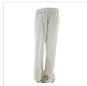
Ladies Applique Palazzo