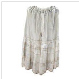
Ladies Sharara Pant